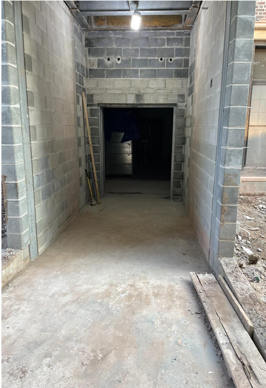
Block work ongoing at SME