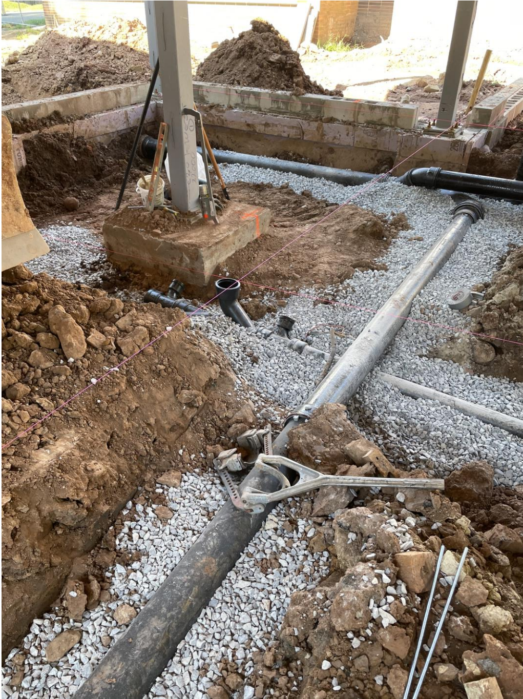
Plumbing underground rough in at SMA