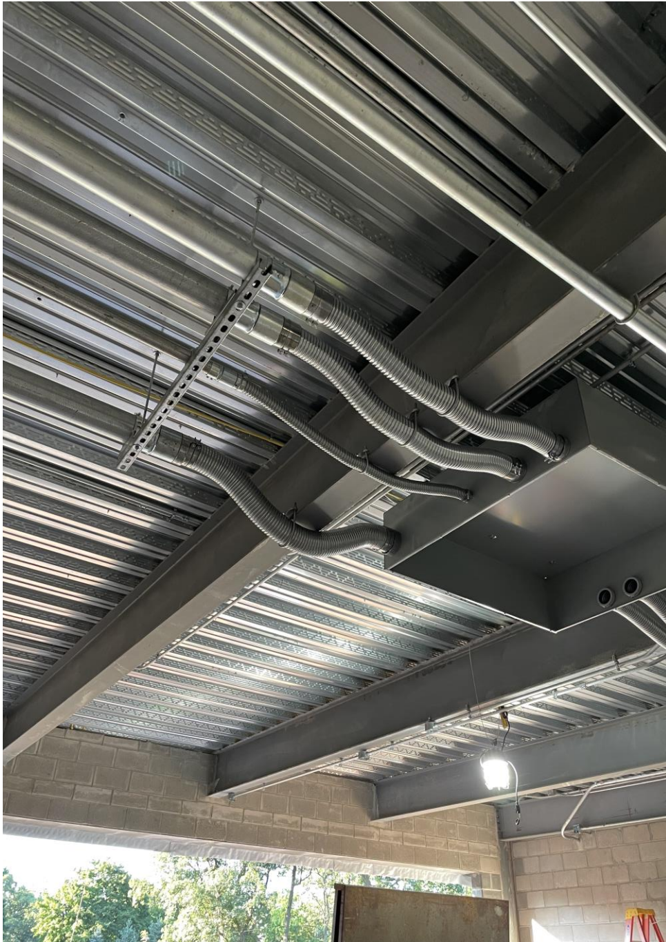
Electric rough in at SME