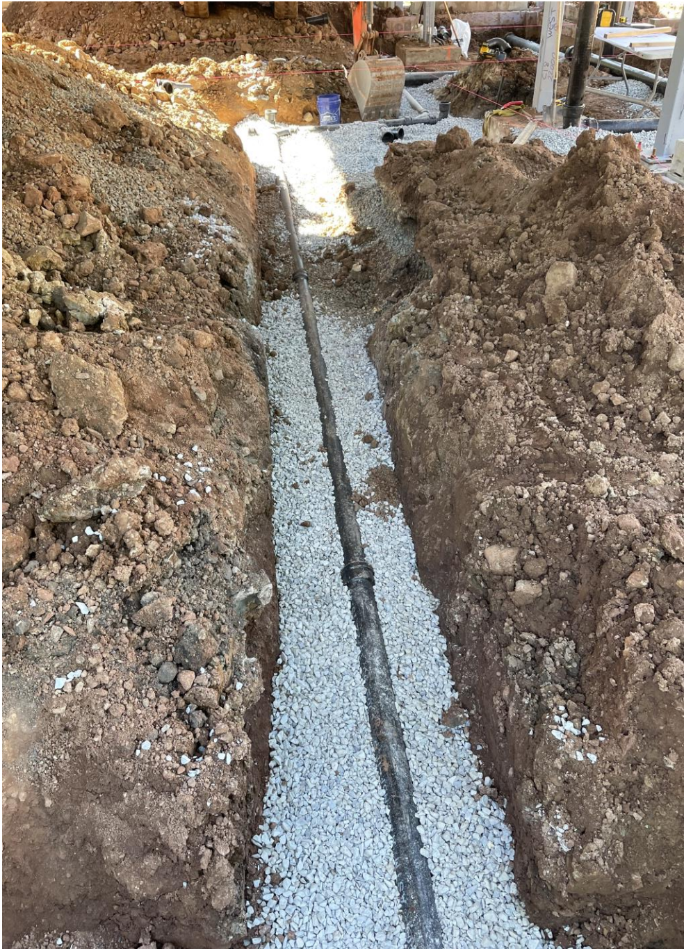
Plumbing underground rough in at SMA