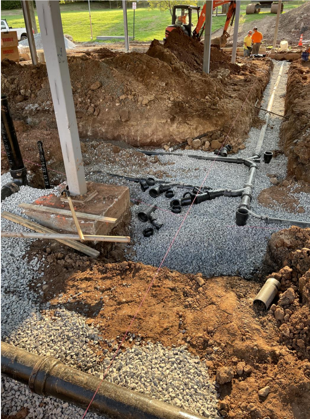
Plumbing underground rough in at SMA