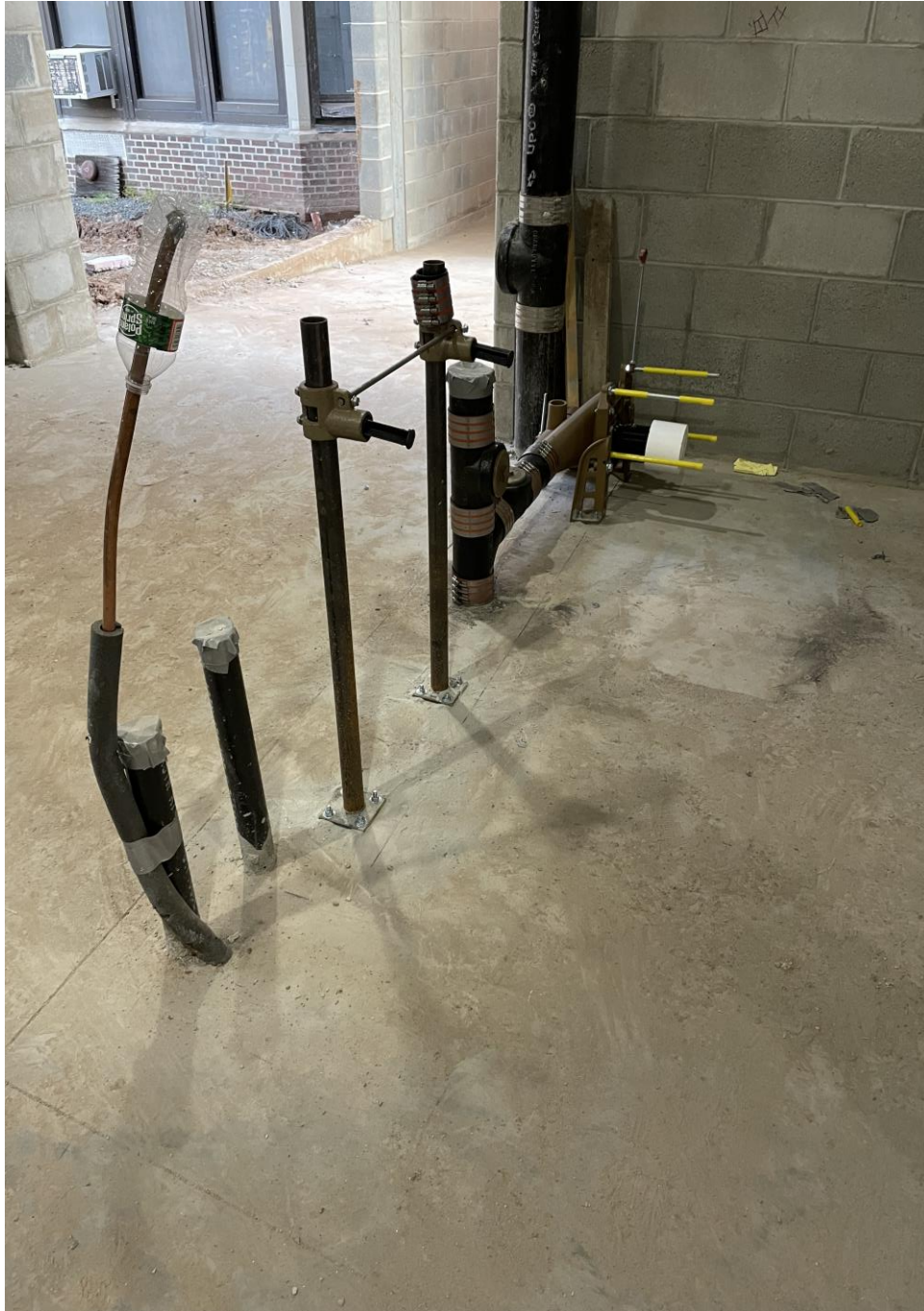
Plumbing rough in at SME