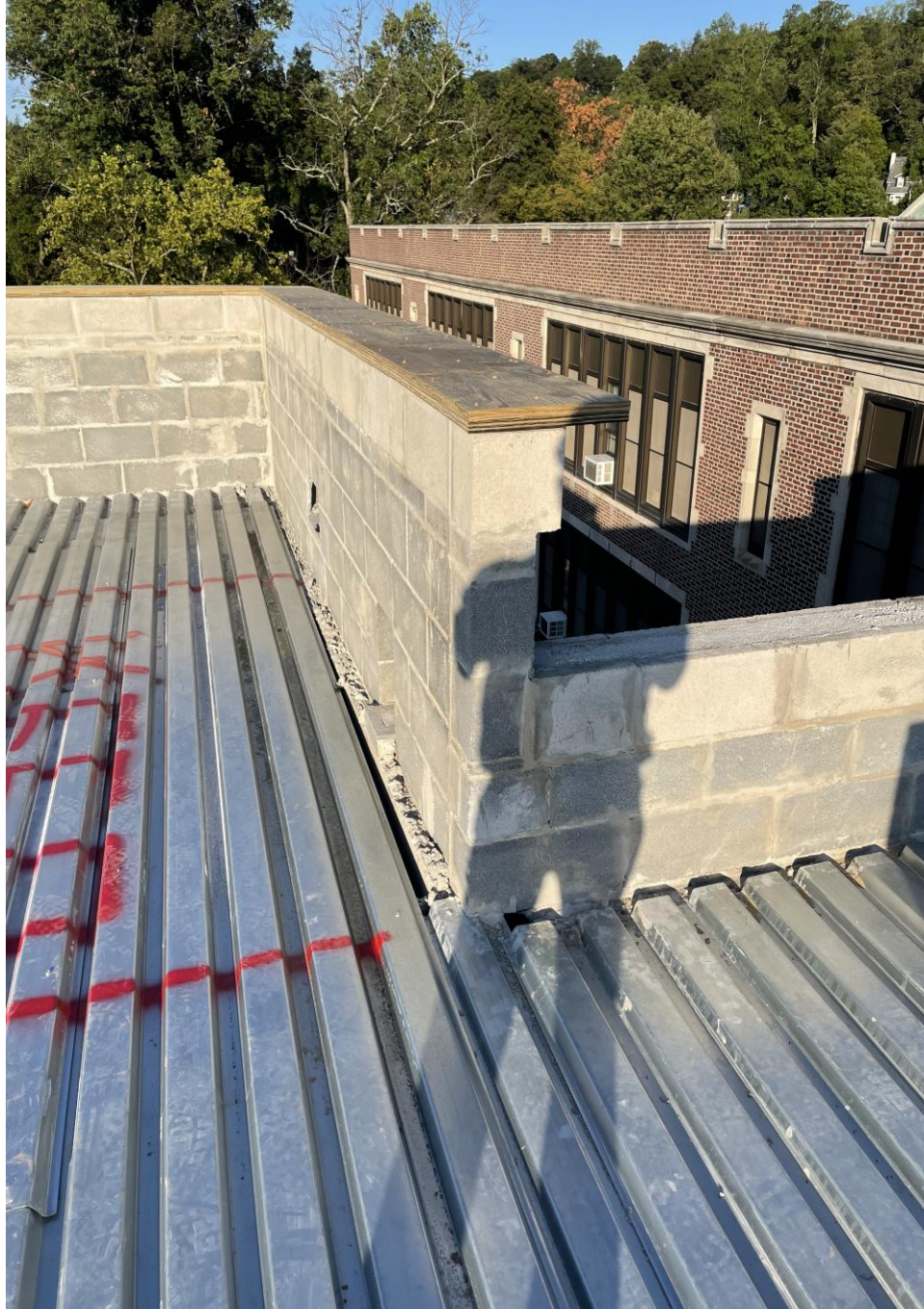
Roof blocking at SME