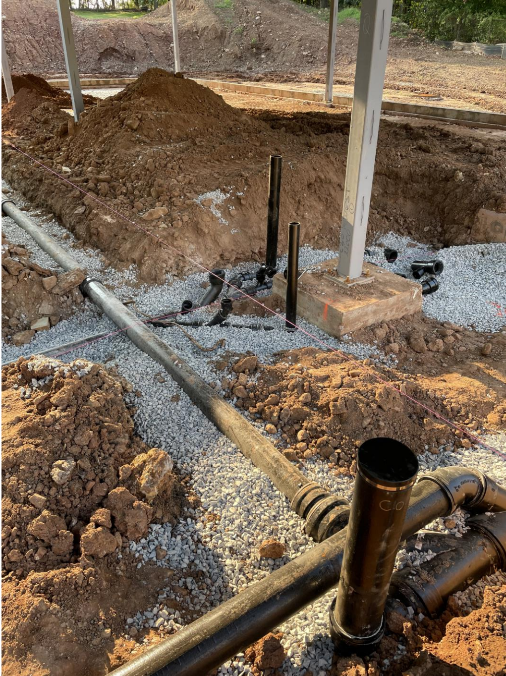
Plumbing underground rough in at SMA