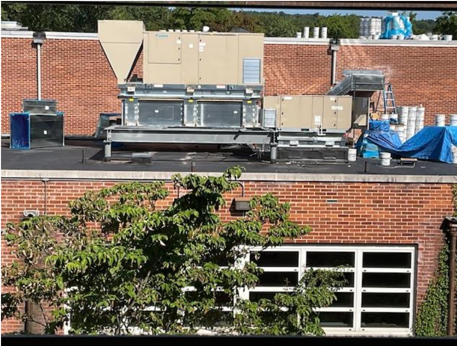
Rooftop ducting underway- Area C (Gym) shown.