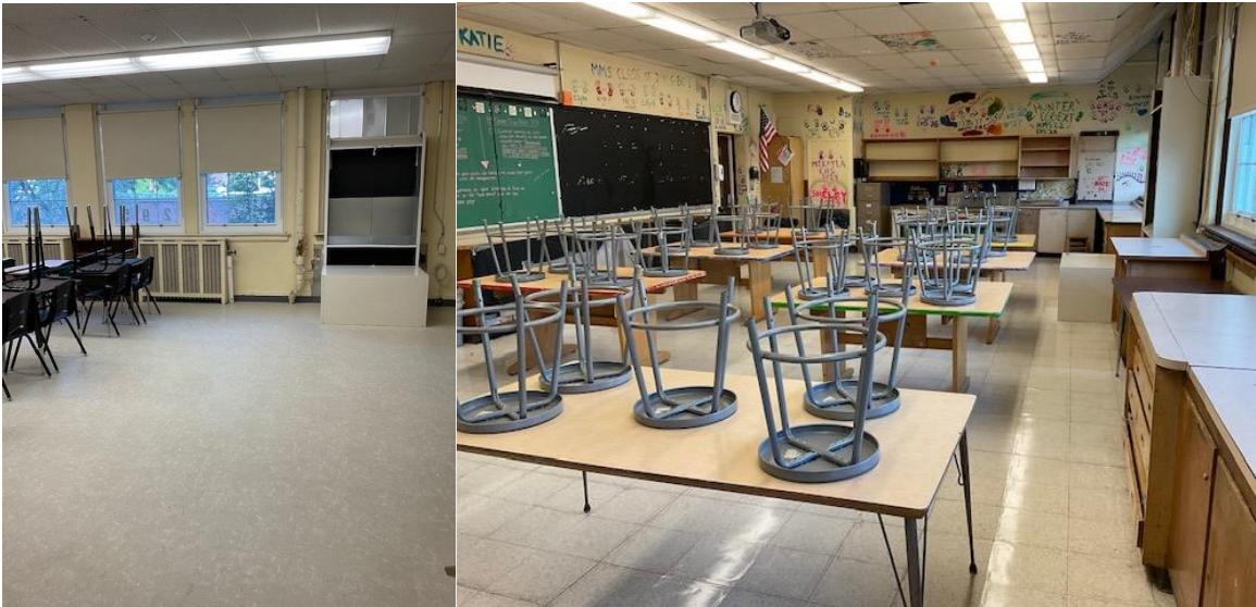
Typical Classroom Setups