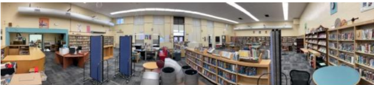
Library (still need some items moved out and others staged at the their final location)