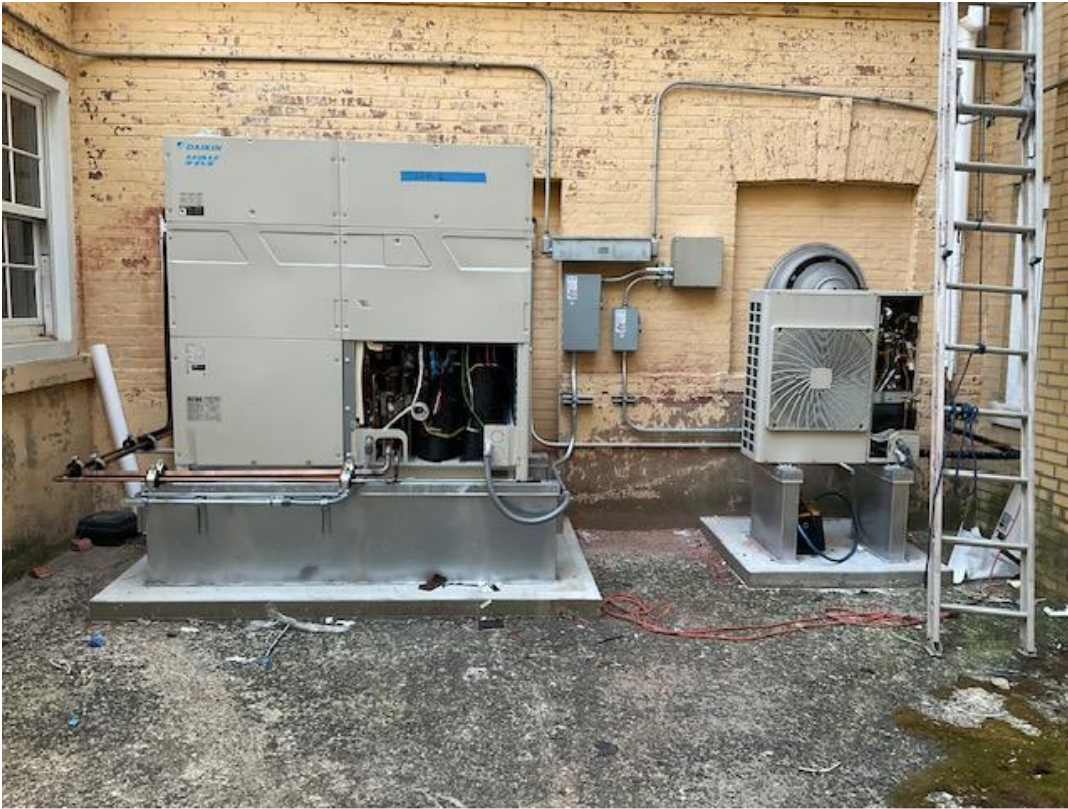
Interior Courtyard Heat Pump Checkout Underway (Typ. of 5)