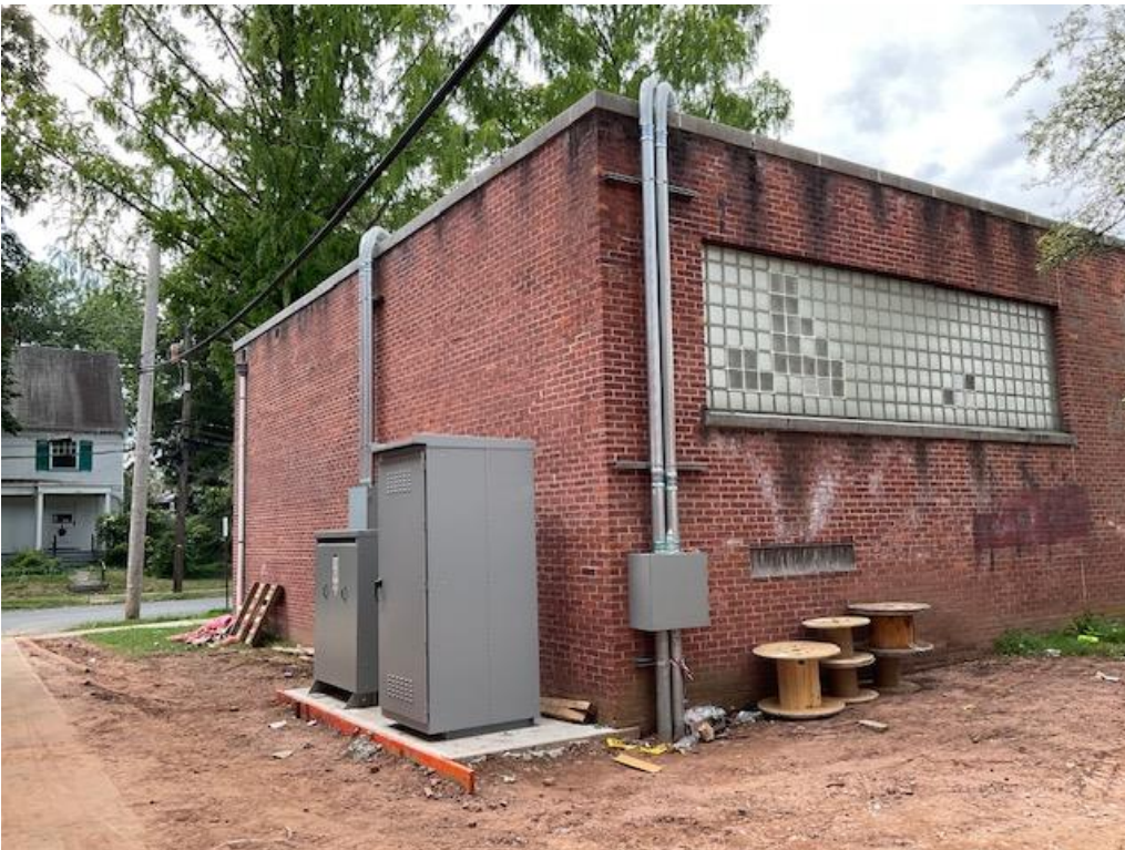
Exterior Electrical Gear Completed (primary service, not show, now energized)