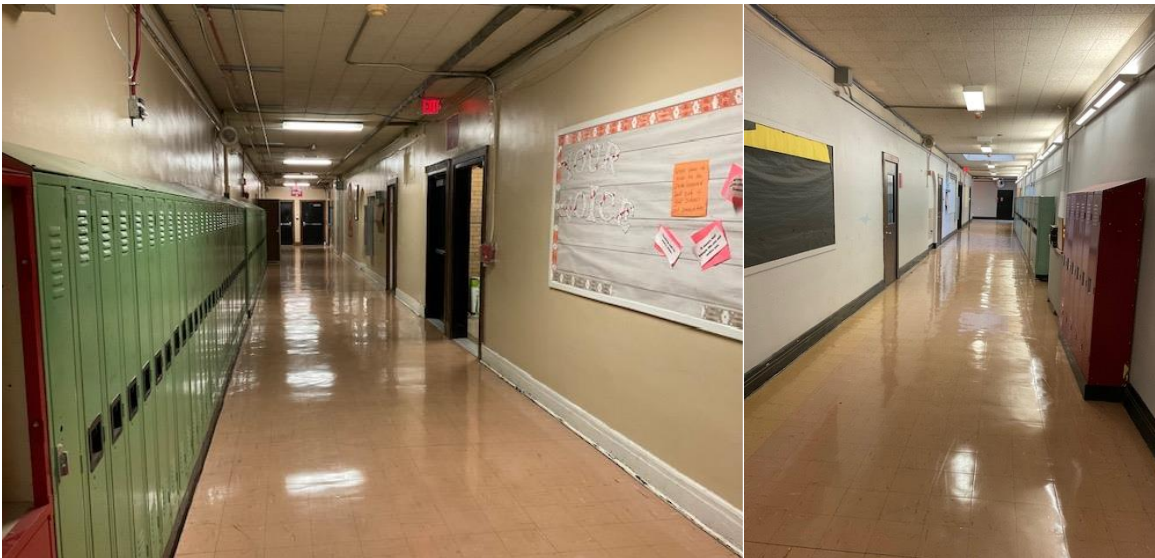
Corridor Clean Up Pics