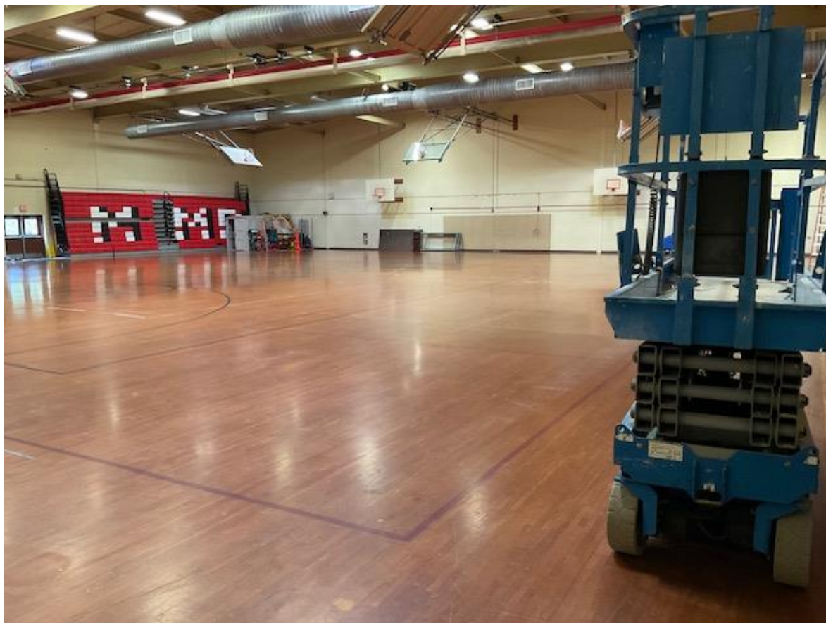
Gym (cleared out for floor preparation)