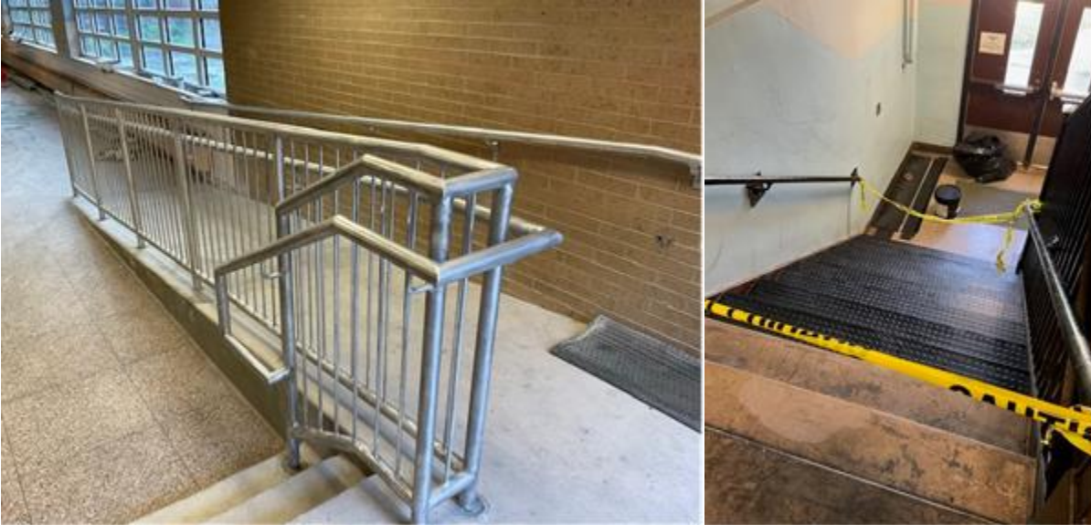
Left: Interior Ramp & Railings, Right: New Non-Slip treads Stairwell #6 in progress.