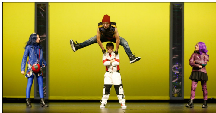
Top photos: CMS musical production of "Descendants The Musical." Bottom photos: CHS production of "Play On!"