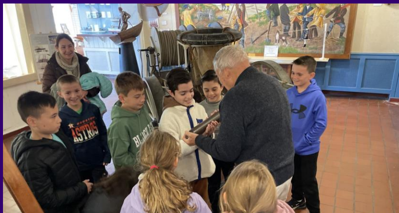
STRETCH Students Visit the Maritime Museum