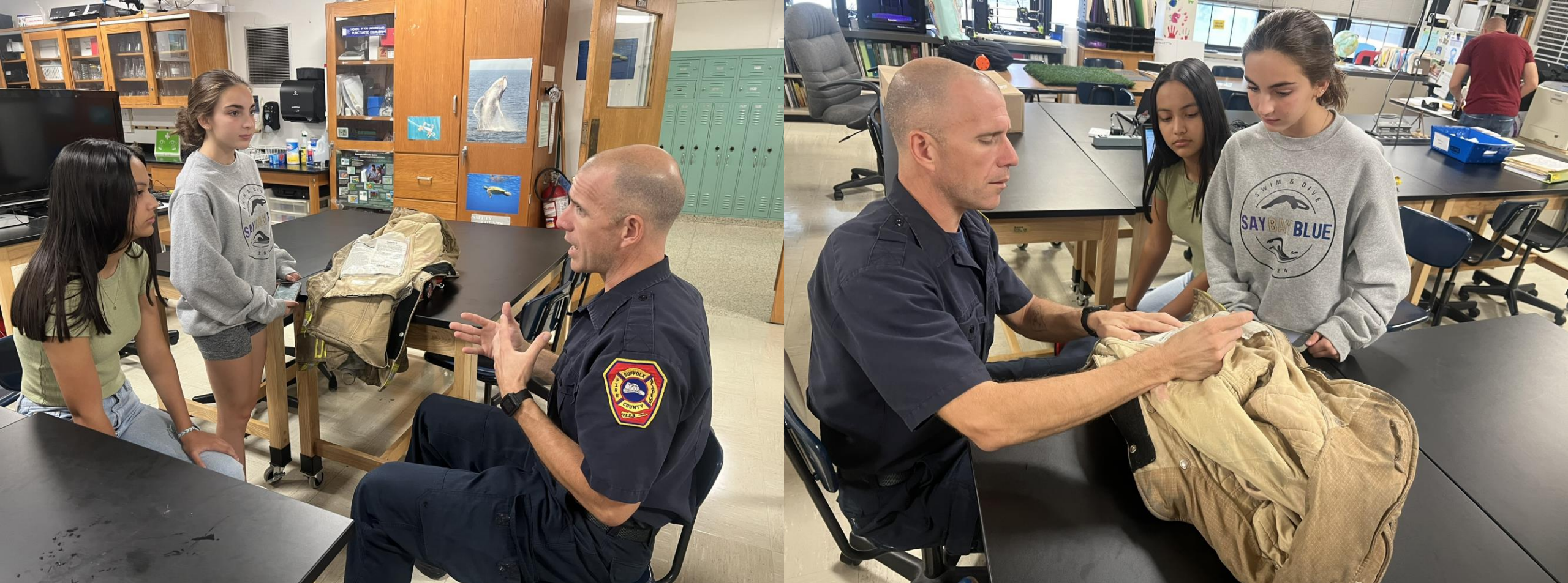
R.I.S.E. Tech Students Collaborate with Firefighters to Develop Safer Equipment