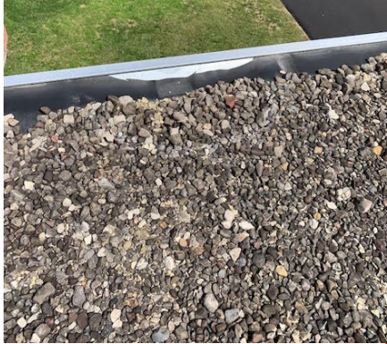
East section of ballasted roof above the kitchen where roofing material is pulling away from the fascia.