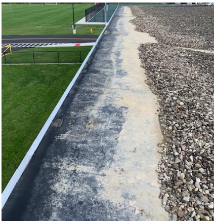
North section of ballasted roof above English and Math classrooms where roofing materials are shrinking and pulling away from the fascia.