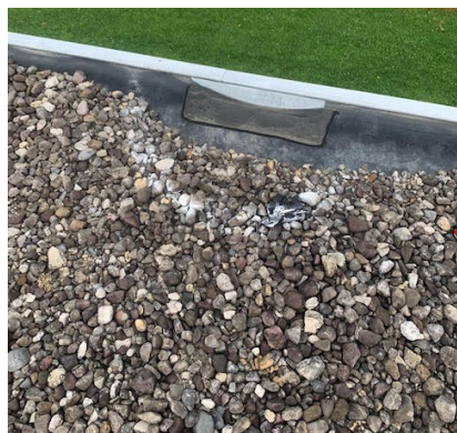
Close up of north section of ballasted roof above English and Math classrooms.