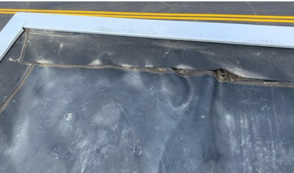
Northeast corner of the High School with tears due to shrinking roof materials.