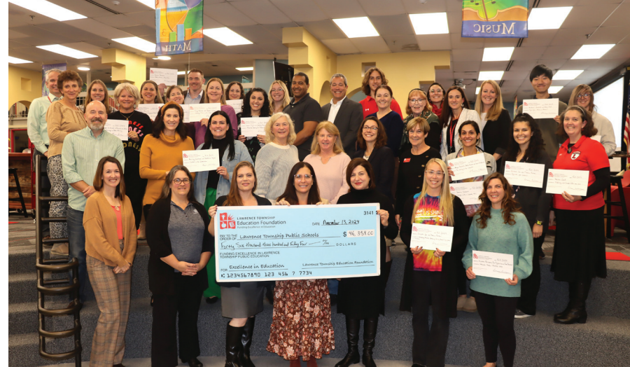
Pictured are members of the LTEF Board of Trustees, LTPS Board of Education and Fall Grant recipients.