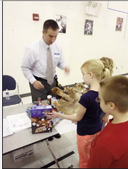
Grocery Store Manager