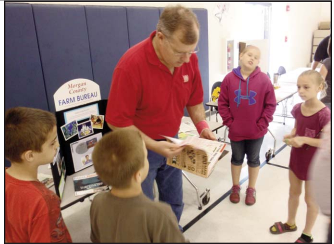
Learning about the Farm Bureau