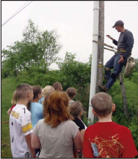
Electric Power Lineman