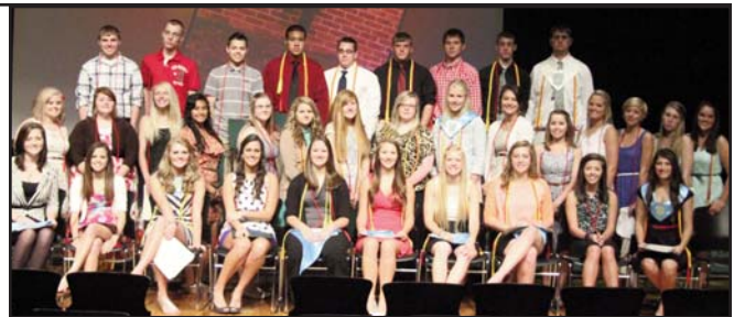
Senior Study Club