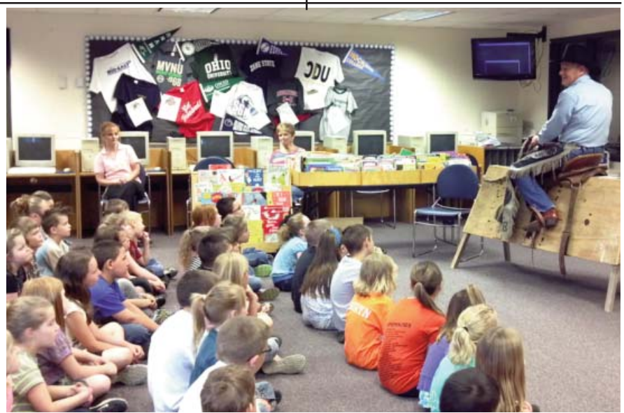
An Author describes the rodeo and the books he has written about cowboys and rodeos