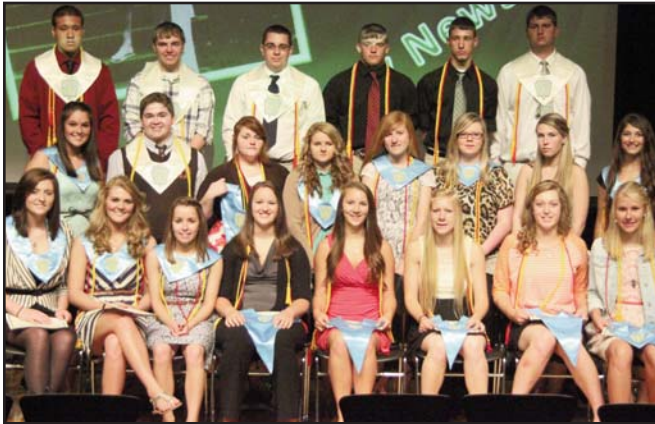
National Honor Society