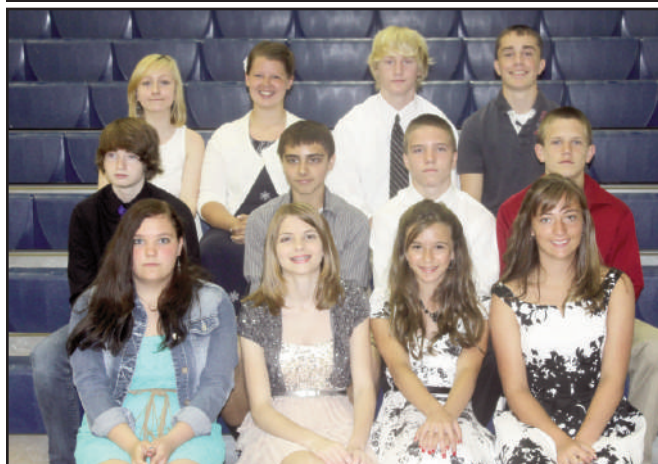
8th Grade Mahle Students of the Month