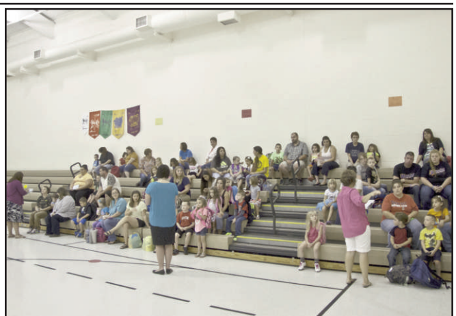
The three kindergarten teachers meet with parents and students on the first day of school.