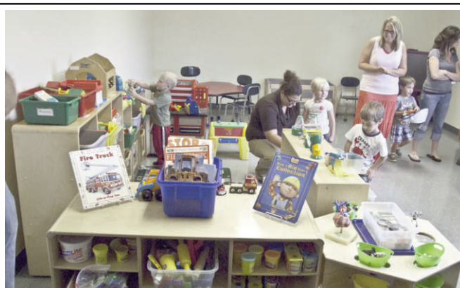
Families visit during open house.