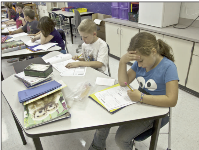
Math problems can be perplexing.