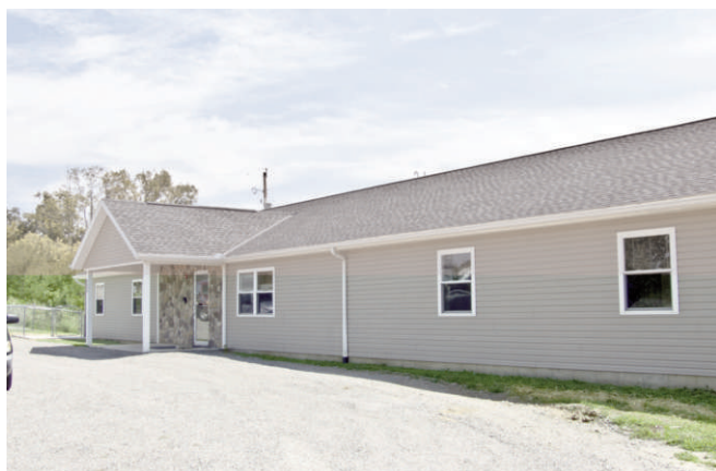
The Morgan Pre-K is on the front of the East Elementary School grounds

Research proves that pre-school is important for every child to gain the skills needed to build a strong foundation for success in school. Pre-school is especially important to children who are developmentally delayed or who do not have the economic advantages of students in wealthy communities. Unfortunately, funding is not yet available for pre-school to be offered to all students in Morgan County.