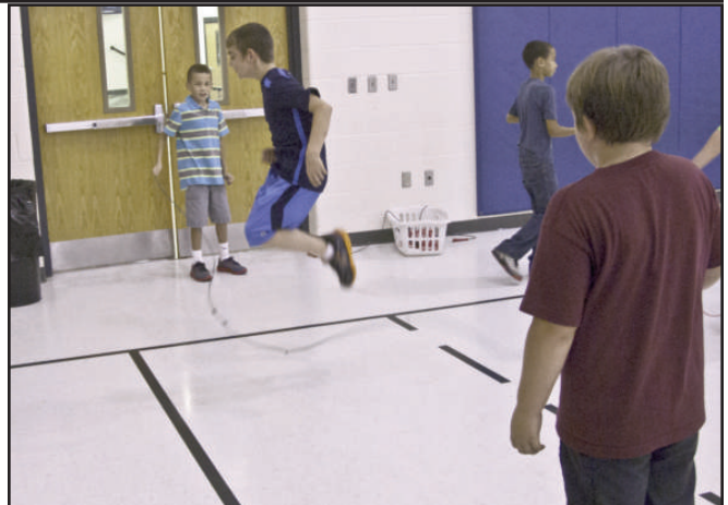
Skipping rope in P.E.