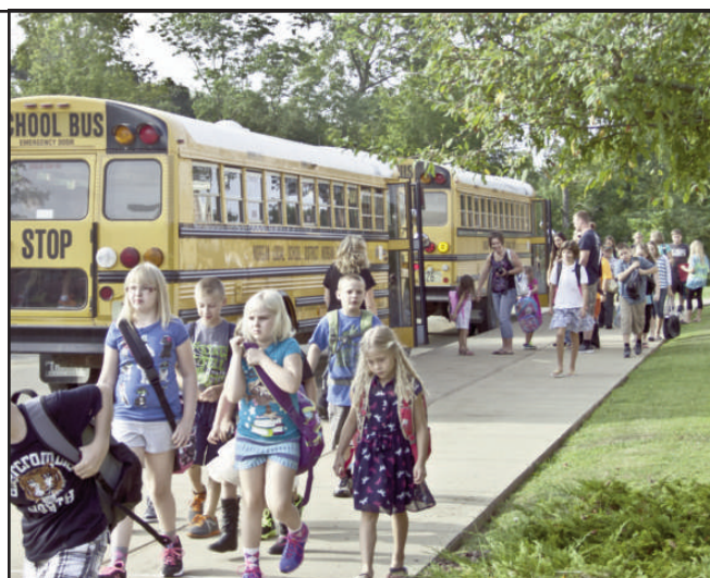
Students arrive ready to begin a new school year.