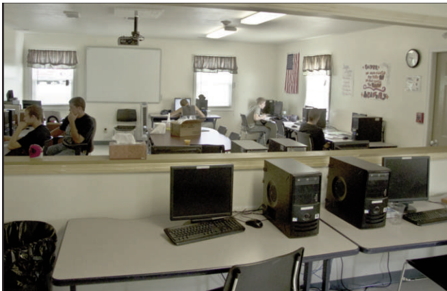
The Raider Academy Classroom

With the purchase of the former Stay and Play Pre-School building, it has been possible to provide Raider Academy with the modern classroom shown below in a separate area of the building.