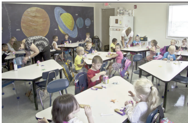
Snack Time At PreK

The new learning standards adopted by the Ohio Department of Education describe key concepts and skills that young children need to develop during the birth through five year old period. These skills include naming colors, numbers, and letters, learning to share and cooperate with other children and adults, language and literacy development, motor development, and physical wellbeing.