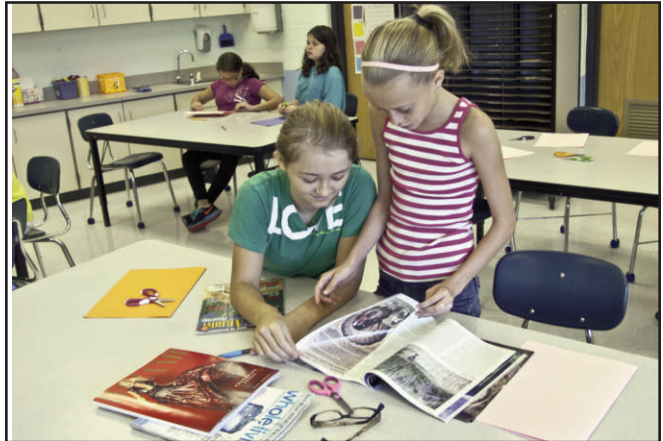
Students in Mrs. Strauss's art class select pictures to decorate their note books.