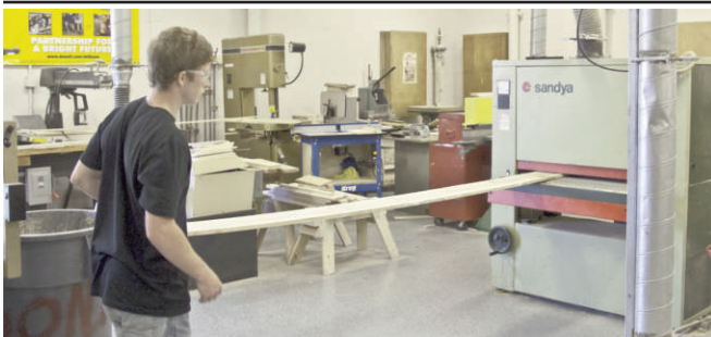
Planing a board in Carpentry