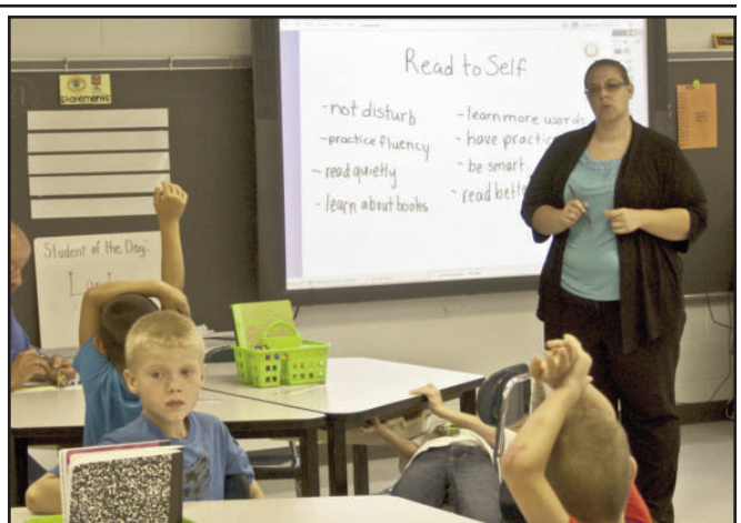
Rules for independent reading