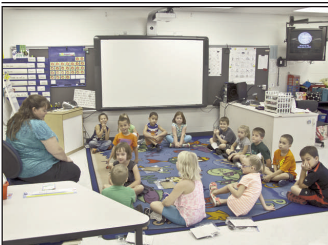
Planning the day's activities