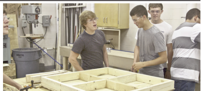
A Carpentry Project