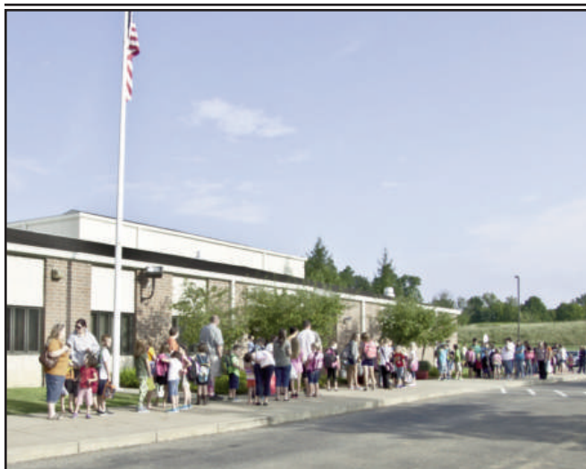
On the first day of school, parents and students line up at East Elementary waiting for the doors to open.