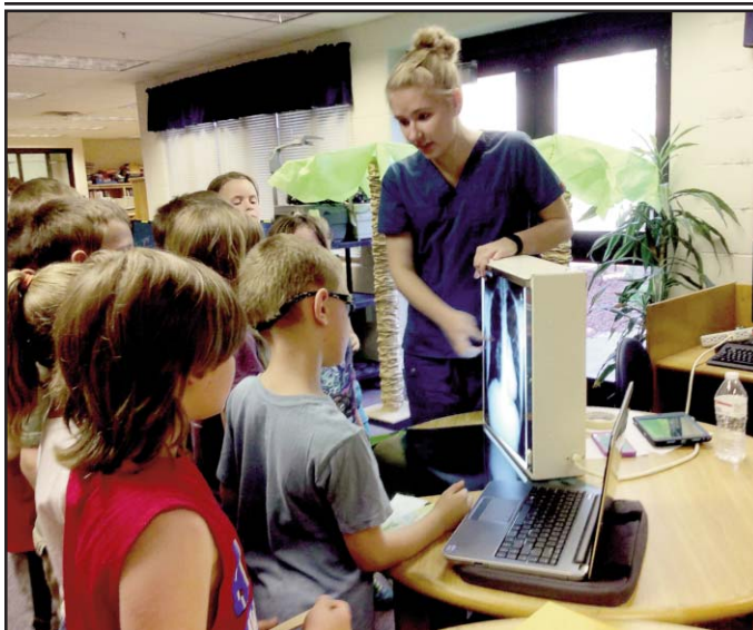
Students look at X-Rays, Part of a Medical Career