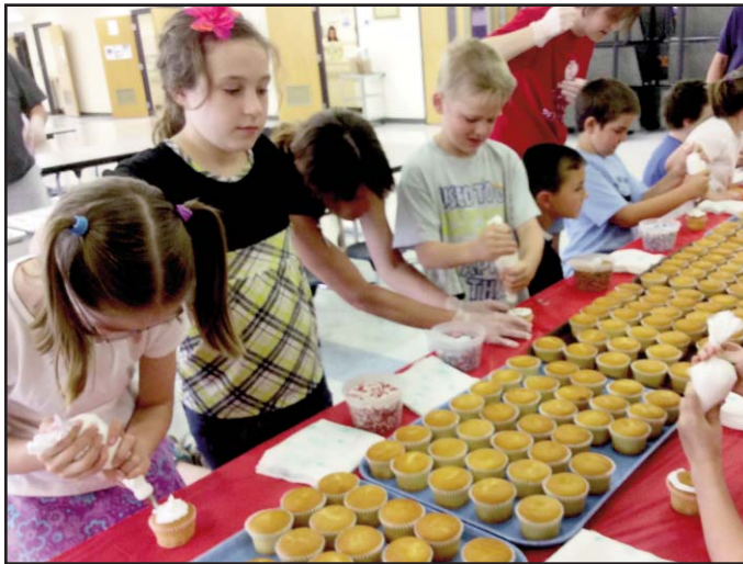
Students Experience A Career in Food Preparation