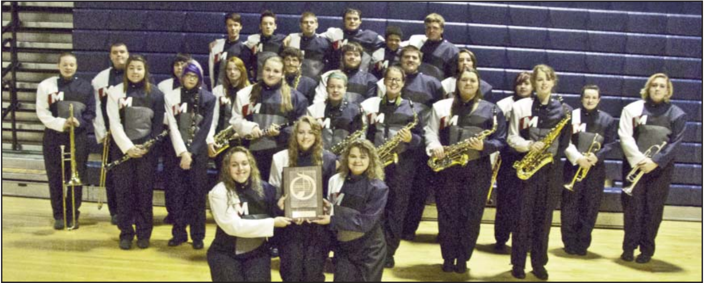
Morgan High School Band members proudly display the Superior Rating Plaque they received at the State Contest. This is the highest award any Morgan Band had achieved in at least 20 years.