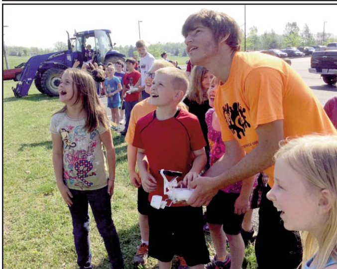
A Morgan Electronics Student Demonstrates Drones

The third annual Career Day was held at West Elementary from 9:30-11:30 on Friday, May 8 th . 17 businesses and classes, including alumni and current high school students, participated in this great event. Presenters were encouraged to talk about how math and science tie in with their careers, what classes are needed to be able to do their job, and where they can find employment for that job when they are looking for employment after graduation. Students were prompted ahead of time about how to ask good questions when talking to the presenters. West PTO provided lunch for all of the volunteers and presenters at the conclusion of the morning. All of the presenters and volunteers filled out surveys stating they would love to come back again. Thanks to all who helped!