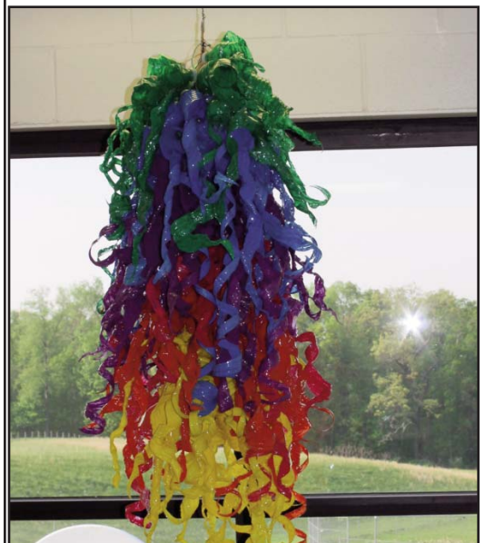
The sculpture installed in the stairwell for all to enjoy.