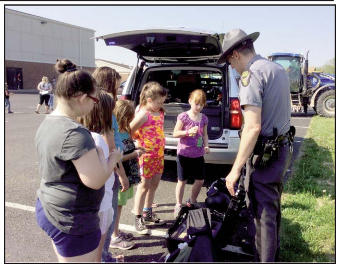
A Career With the Highway Patrol