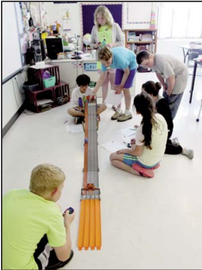
Making Science Fun

The 5th grade students in Miss Rishel's science classes applied their knowledge of force and motion to conduct an experiment using Hot Wheels cars. The students had to run time trials on both smooth and rough tracks to determine the impact of friction on the movement of the cars. Students also had to determine the speed of the cars. Mass can play a role in the movement of the cars and the force needed to cause that movement. Students added weights to their cars to change the mass and ran the trials again. The 5th graders really enjoyed the opportunity to apply the science content to a hands-on situation.