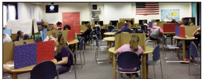
Taking the PARRC Test on Chrome Books

Morgan schools have over 2,500 computers available for the use of our students. Many classrooms have enough Chrome Books (small personal laptops) for each student.