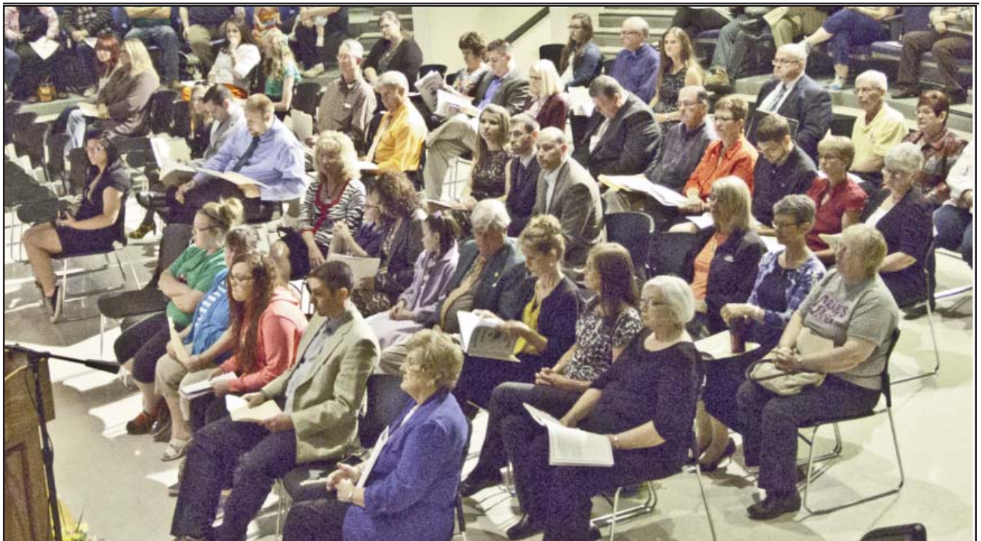
Scholarship donors wait to present their awards