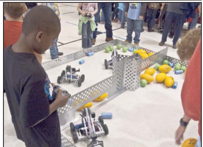
Robots created in the Career Tech program fascinated elementary students.