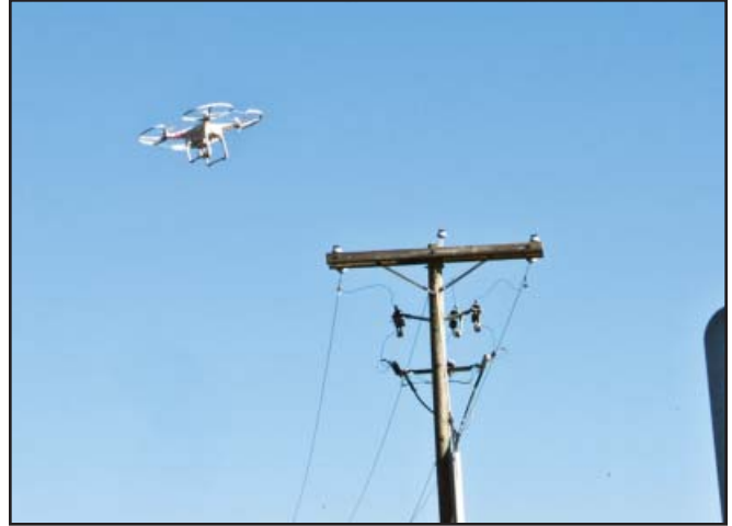
The High School Career Tech Electronics department demonstrates drones.