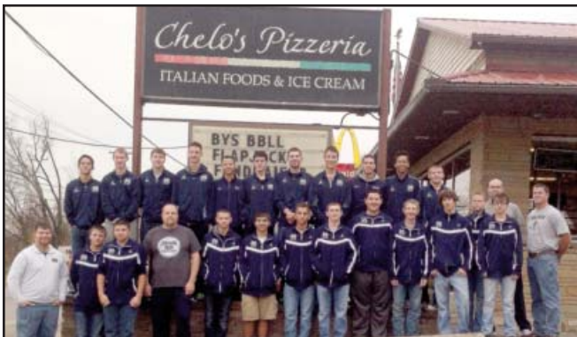
The boys basketball team hosted their 3rd Annual Flapjack Breakfast in order to meet the community.