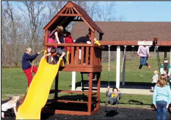
East 2nd graders enjoy new playground equipment purchased with Boxtops for Education collected by the students and staff of the school.