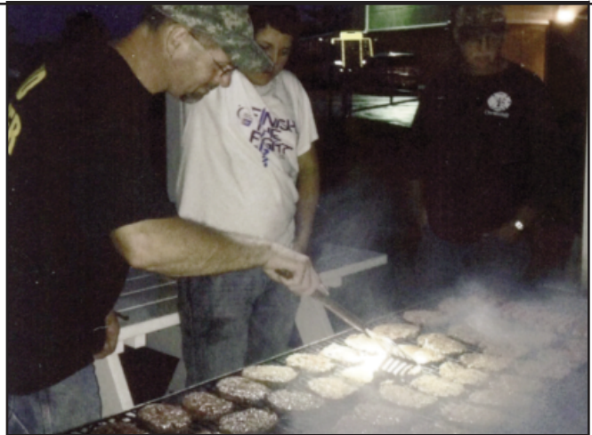
Chesterhill Fire Dept. fry steaks for the meeting.