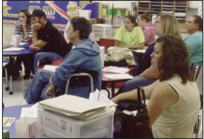
Parents listen to staff presentations.

The staff at Morgan South Elementary is very appreciative of everyone who attended. We would also like to thank the Chesterhill Fire Department for cooking the best steak sandwiches in the county. We hope to see all who attended back for our family night again next year!