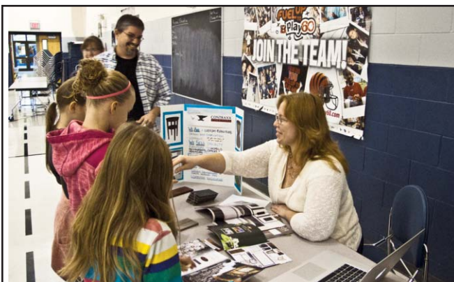
A career in furniture design