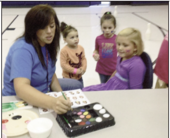
Children receive face paintings.