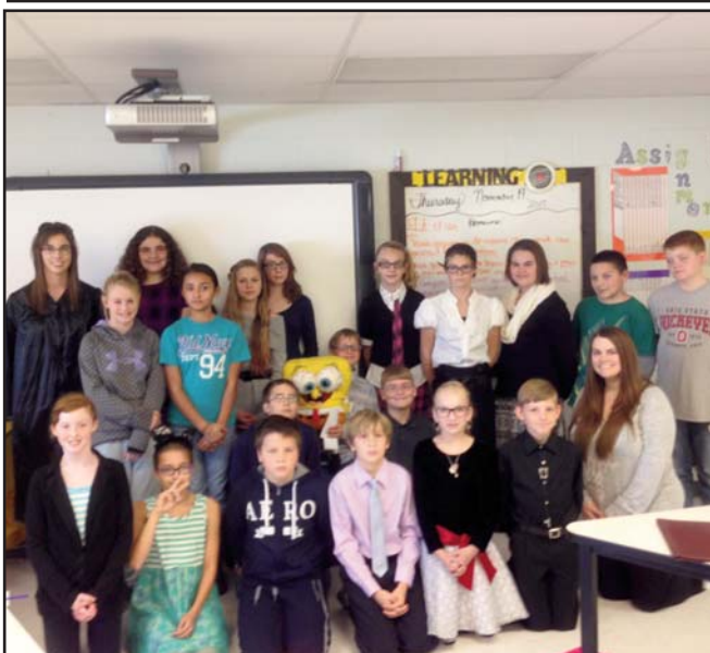
The Trial Participants