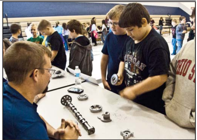
Representatives from MIBA discuss careers in precision machining.