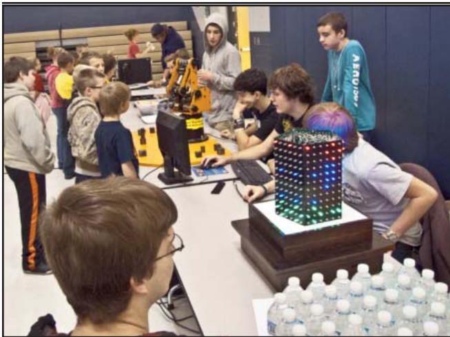
The Morgan Career Tech Electronics Program demonstrates their activities for elementary students

Although these pictures were taken at the West Elementary Career Day, similar activities take place in all of our elementary schools.