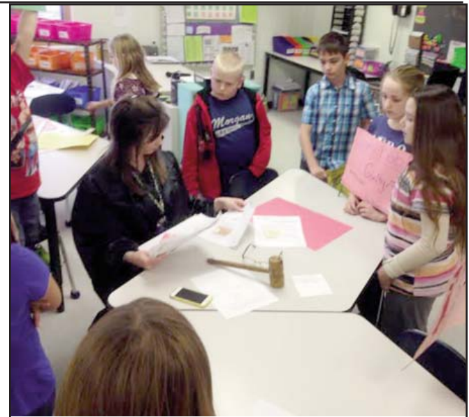
Students collect and prepare evidence