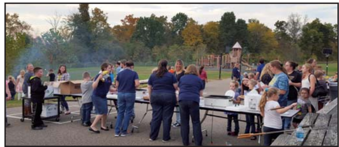
Community members at East enjoy a cookout.

Pictures here show a parent/community cook out at East and the MHS Basketball Team meeting the community for breakfast. (See page 3 for more BCEP pictures)