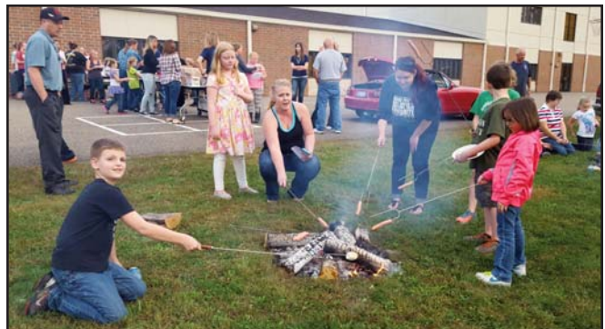
East students enjoy a marshmallow roast during parent meetings.