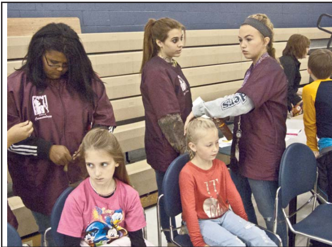
The High School Career Tech Cosmetology students demonstrate their skills on West students.