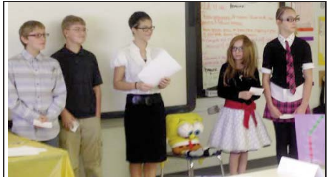
Conducting the Trial