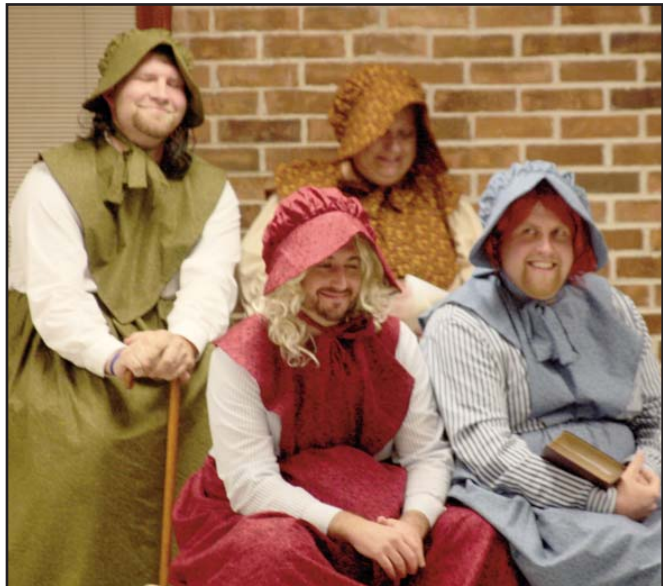
Notice the beards on "them thar ladies" (See page 8)