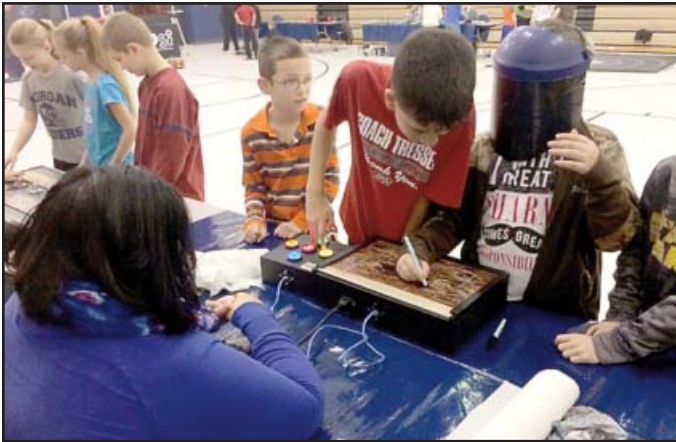
Students practice a simulated Mars landing.

On January 19th, COSI on Wheels presented “Astounding Astronomy” to the students of South Elementary. The students participated in a variety of hands-on activities to learn about the sun, stars, and planets. Some of the activities included how weight changes on different planets, how different types of light vary on the visual spectrum, the distance between planets, and the locations of constellations in the night sky. This program supported the academic content standards for Earth & Space Science and Physical Science.