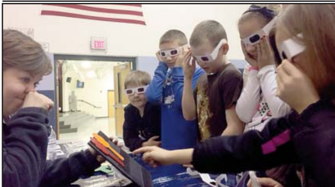
Students experience how colored glasses change the appearance of colors.