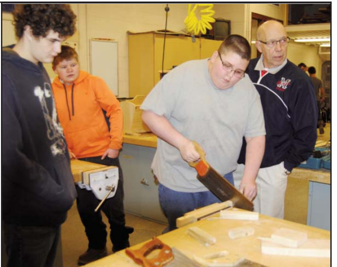
Students had some "hands-on" experiences during the Career Tech visit.