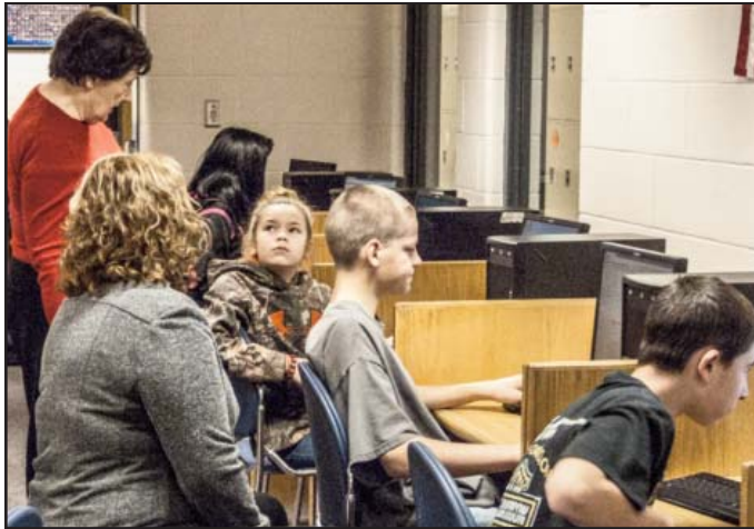
Mentors work with students on a computer activity.