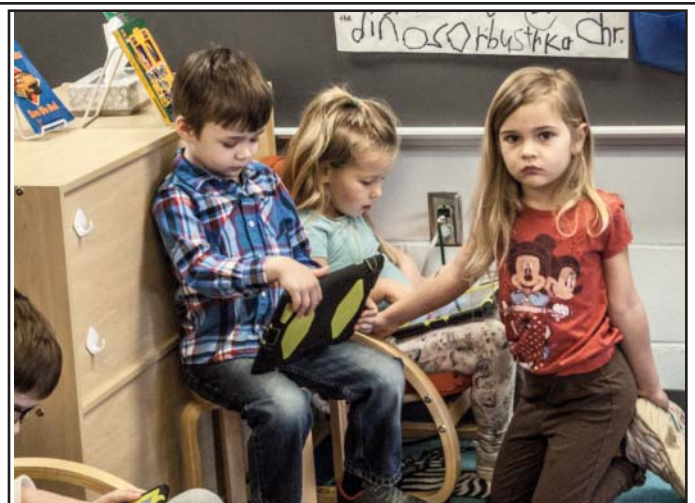
These preschool students work together on an iPad activity.