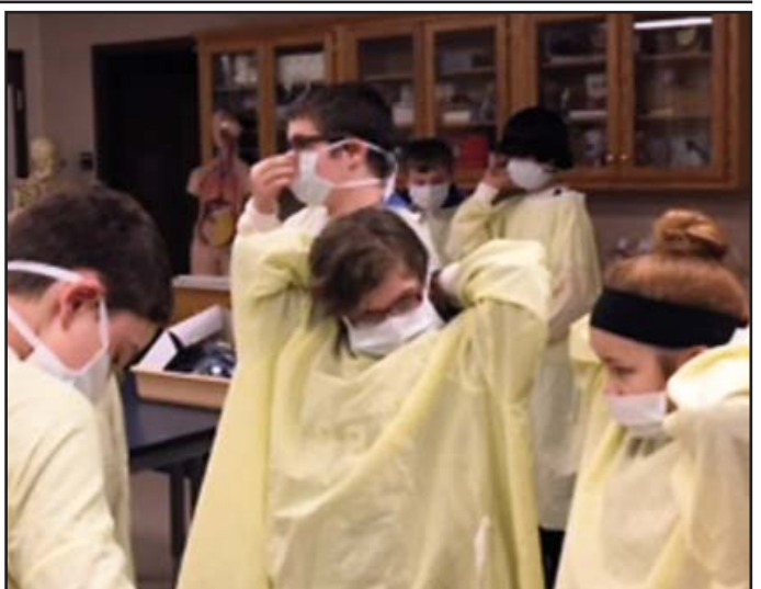
Suiting up for Health Technology