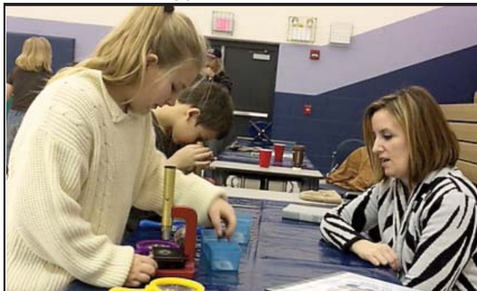
Students identify different types of rocks.