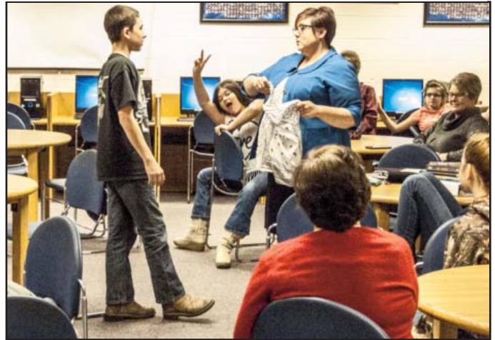
Students in the mentoring program enjoy a game.

A Community Connector Grant awarded to 8 Morgan Social Service agencies in cooperation with Morgan Local Schools is supporting a Mentoring Program at Morgan Junior High School. The program involves about 40 students and their adult mentors. Students selected to be mentees in the program are recommended by their teachers and principal as needing that extra boost to meet their potential for success. The program, Discover Your Potential, emphasizes 5 core principles: