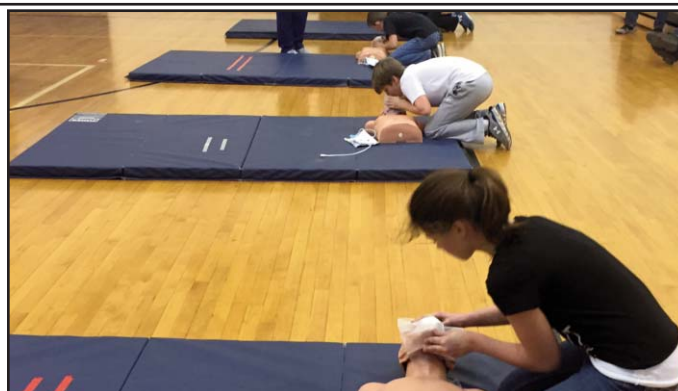
Mouth to Mouth