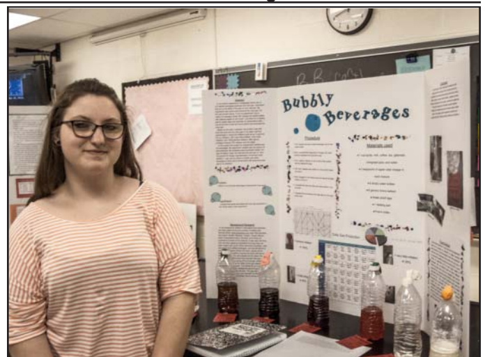
Which beverage produces the most stomach gas? --- Samantha Butts