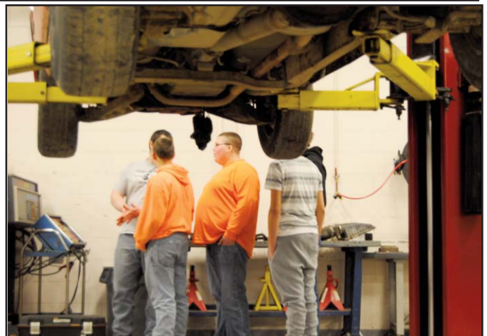
Boys in the mentoring program were very interested in the Auto Lab in the Career Tech Program.

One of the more popular activities in the program has been the visit to the Morgan Career Tech Programs at Morgan High School as illustrated in the photos on the right. Students learned about the Health Tech courses, the Precision Machining Courses, Auto Mechanics, Carpentry and Cosmetology.