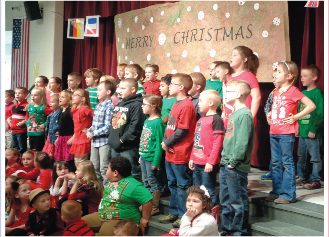
Second Grade Class performing