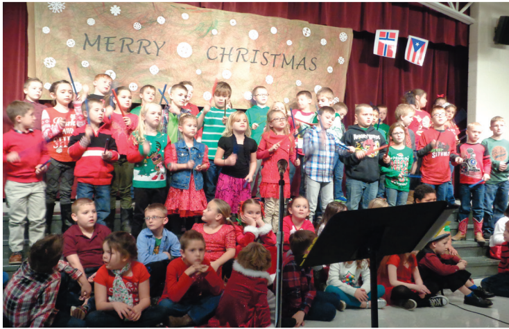
Second grade class at Christmas Program