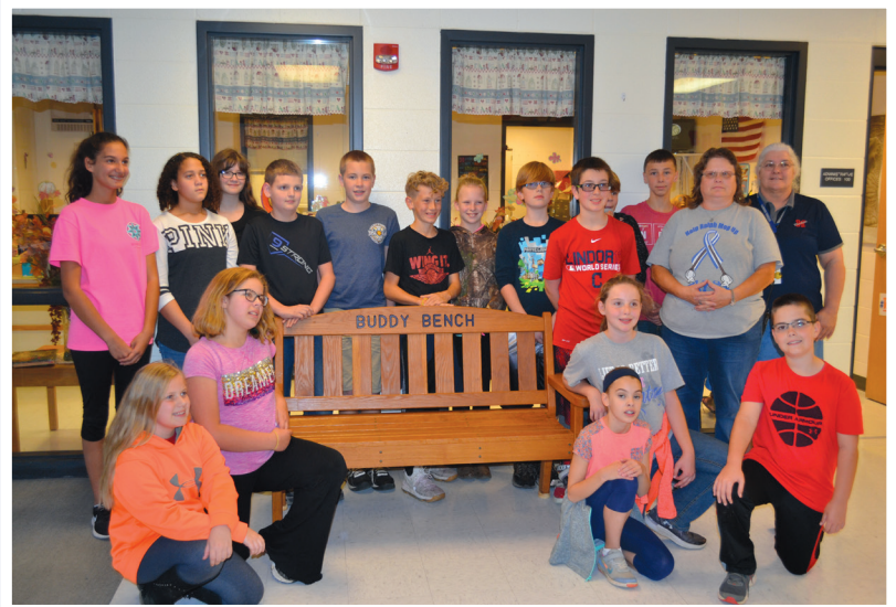
Buddy Bench with class