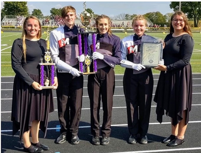
Congratulations MHS Marching Band! (article upper right)

On September 21st, Morgan High School Marching Band finished first place in class B at the Bloom Carroll Classic, earning best overall percussion, and Grand Champion, class B and C. Additional awards this season include Licking Heights and Maysville, earning second place, and third place at the Meadowbrook Festival of Bands. The final competition of the season will take place at Tri-Valley High School on Saturday, October 26, 2019. Their goal is to qualify for OMEA State Marching Band Finals for the third consecutive year. Best of luck!