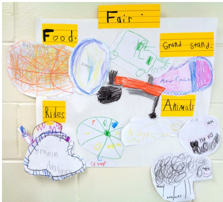
Daytime at the Fair