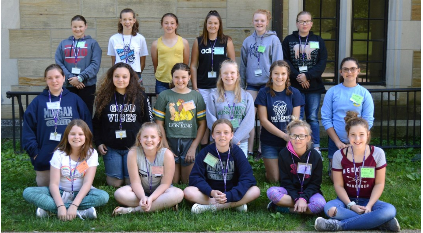
Junior High Be Wise Campers