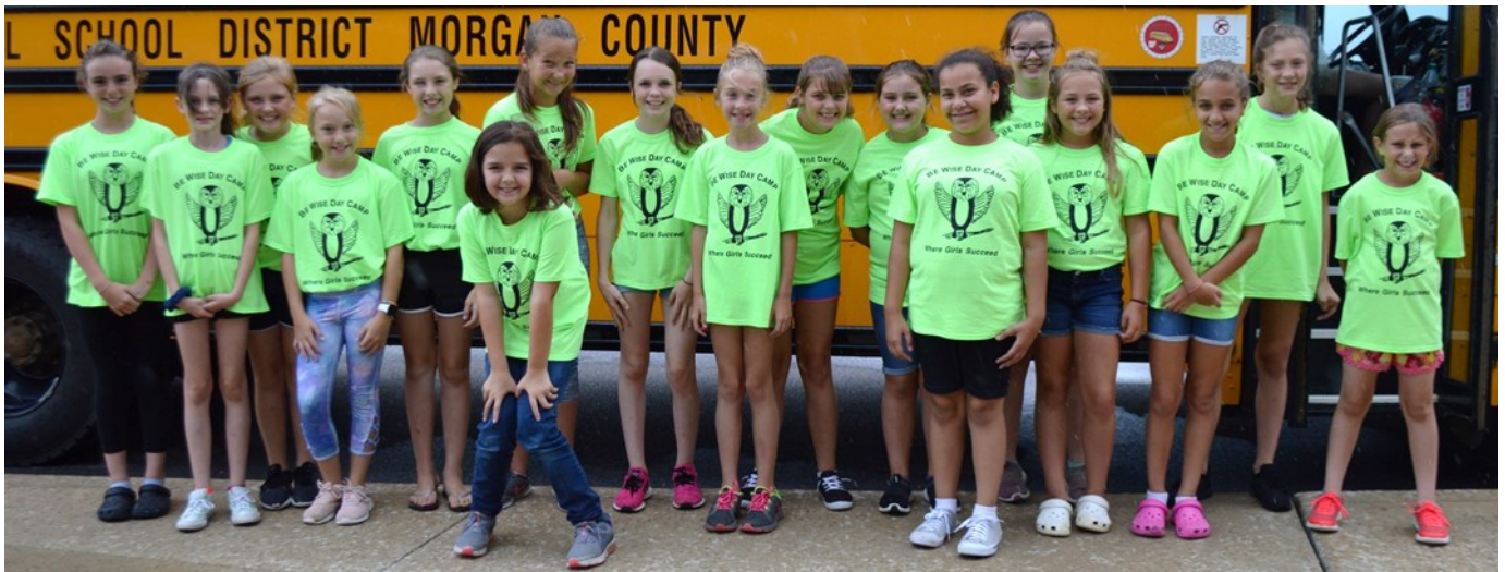
Elementary Be Wise Campers

Several young ladies from Morgan Junior High attended the BE Wise STEM (Science, Technology, Engineering, Math) camps for girls in June at Kenyon College. "BE Wise Camp's mission is to develop interest, excitement, and self-confidence in middle school girls in Science, Technology, Engineering, and Math. They hope to provide the girls with the confidence and motivation to enroll in more STEM classes at high school and college levels to prepare them for careers in a STEM field. The camp is designed to provide real-life, hands-on experiences in STEM using problem solving and thinking skills." This is the second summer Morgan Local School District was able to send students to the annual camps. Eighteen Junior High students and seventeen Elementary students were able to take advantage of this learning opportunity.