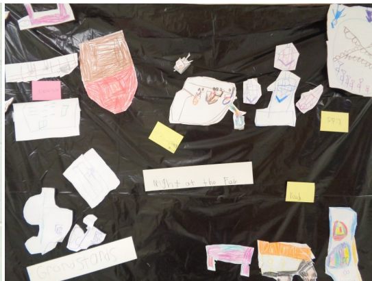
Nighttime at the Fair

The first grade students discussed what they learned about the fair from reading books, their observations, and class discussions. The week culminated with the students creating murals to show what they know.