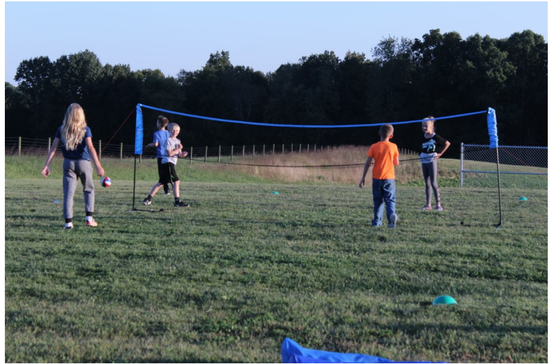
A group of 5th and 6th grade students enjoying the volleyball nets at BCEP.

The staff at South Elementary would like to thank everyone that attended. We hope to see all of you at next year's Family Game Night!