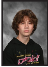
Cooper Dunlop Counseling