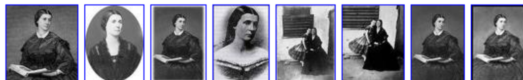
Image results for Rose o'neal greenhow - Report images

Rose O'Neal Greenhow (1817–October 1, 1864) was a renowned Confederate spy. As a leader in Washington, D.C. society during the period to prior the American ... Life prior to the Civil War - Espionage during the Civil War - Capture en.wikipedia.org/wiki/Rose_O'Neal_Greenhow - Cached - Similar