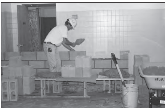
Masonry work is completed at Ellicott. Here, a worker crafts a wall creating a walkway from the boy's locker room to the gymnasium.