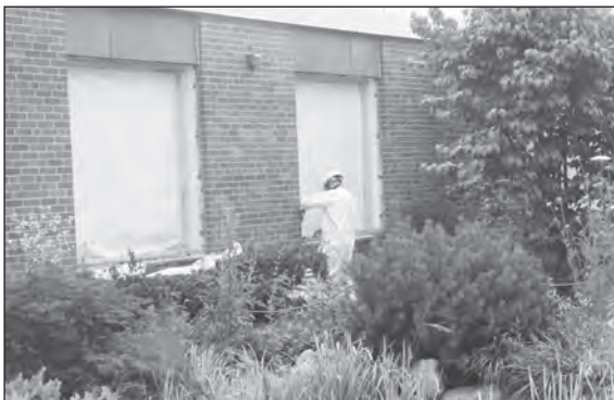
Workers complete asbestos abatement before the installation of new windows in the courtyard at Ellicott Elementary.