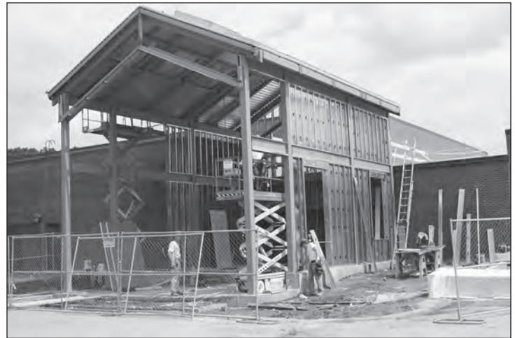
An addition on the Freeman Road side will provide additional room around the gymnasium, and allow for safer entry and exit from the High School.

Work on Phase Two includes a new entryway on the Freeman Road side of the High School,