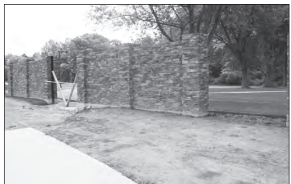
A paved entryway and brickwork are under construction at the Athletic Field.