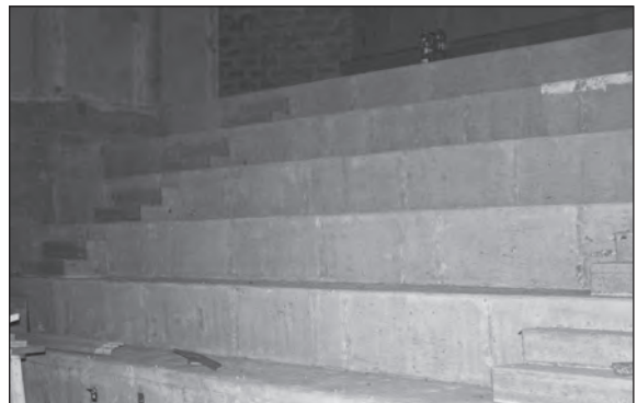
The upper portion of the auditorium, which formerly contained purple seats.