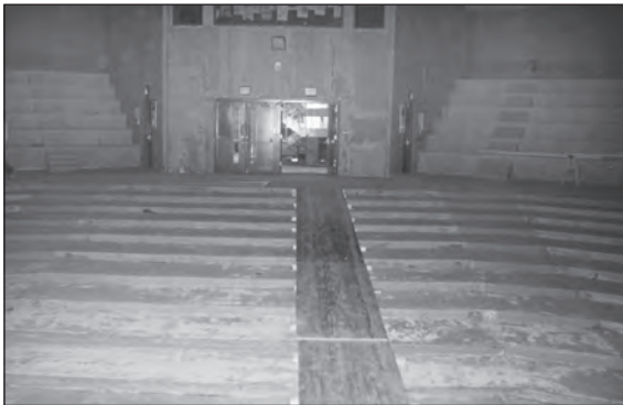
The High School Auditorium was gutted in early July. When complete, the aud will feature new seating, carpet and an updated sound system.