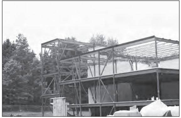
Framing of the three-story addition underway.