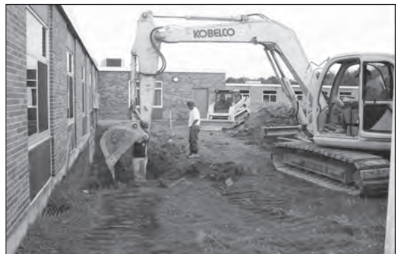
Drainage work around the perimeter of Ellicott Elementary continues.