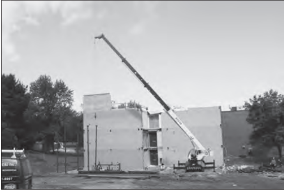
A crane lowers steel for framing of the High School Science Addition.