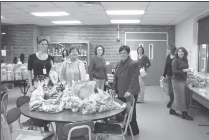
Members of the Eggert Road Elementary Wellness Committee stand with just a few of the items collected during a school-wide food drive. Donations will benefit Orchard Park Families-in-Need.