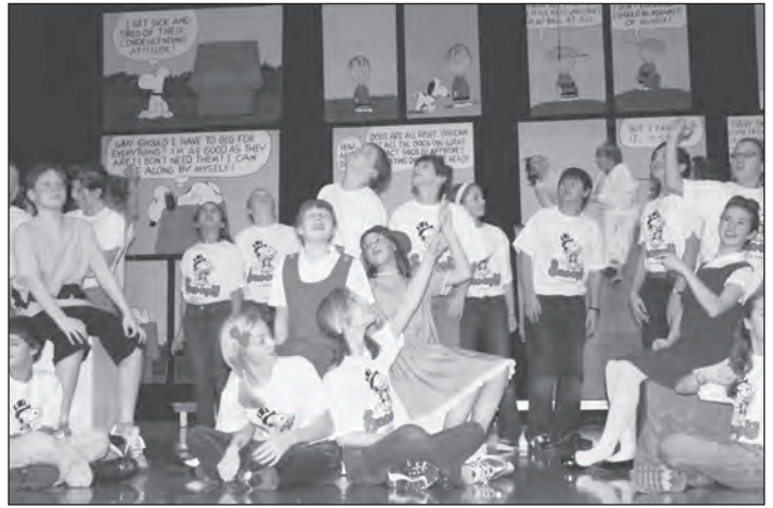
Members of the cast of "Snoopy" perform onstage at the Middle School. The show was presented to hundreds of thrilled audience members the weekend of November 20 & 21.