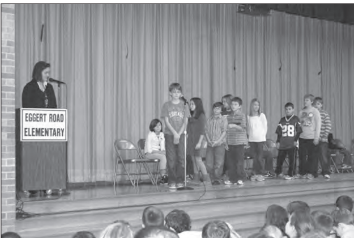
Fifth grade students at Eggert Elementary stand in front of the student body during the National Geographic Geography Bee, which was held at the school in November. For information on the winner, turn to page five.