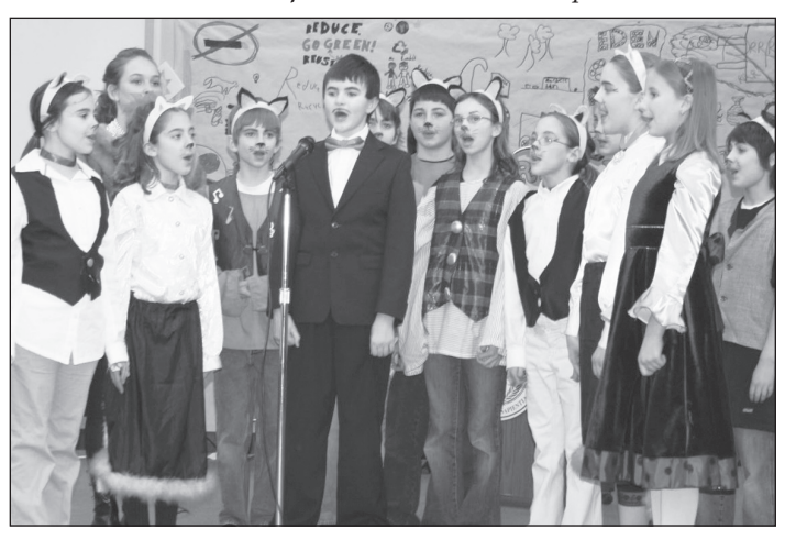
Leads from the Ellicott Elementary School production of "The Aristocats" performed live at the February Board of Education Meeting as a precursor to their performances in the school's cafetorium. The show is based on the Walt Disney animated feature.