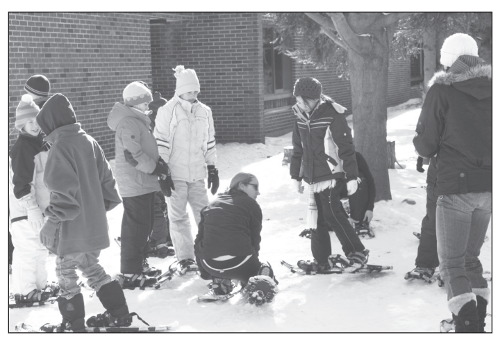
South Davis Elementary students take full advantage of an abundant resource in Buffalo - snow! The South Davis Wellness Committee, along with the PTO, once again sponsored a snow shoeing demonstration with staff from Earth Spirit.