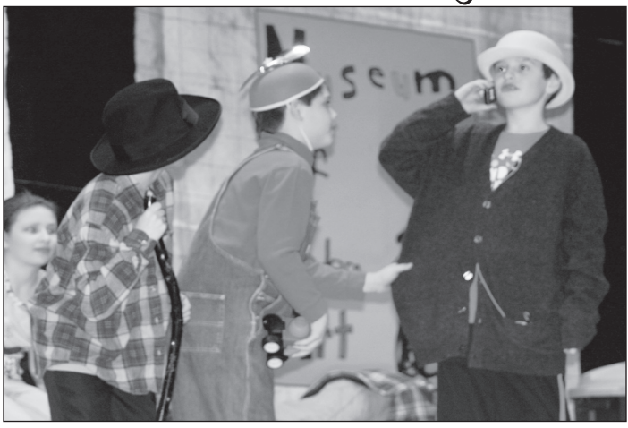
Pictured above are performers in the South Davis Elementary School performance of "Buskers." South Davis students in grades 3-5 conceptualized, wrote and performed the play, which included four student music compositions.