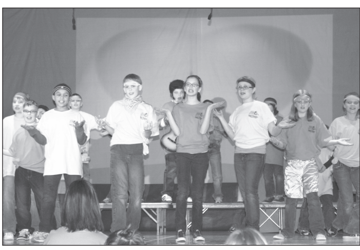
Eggert Elementary 5th Graders taught audience members about grammar, science, economics, history and math during their performance of "Schoolhouse Rock Live! Jr."