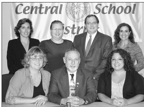
Members of the 2010-2011 Board of Education

The Board supports the District Goals and Guiding Principals, and will work closely throughout the year with District Administrators as they focus on the continuous improvement of student achievement, citizenship and character development. This year,