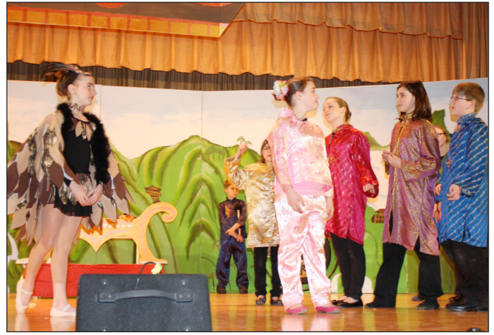
Students from Windom Elementary performed two sold out performances of "The Nightingale" on February 15 and 16.