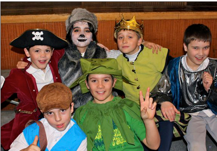
Performers from South Davis Elementary School's "The Granny Awards" take a break during their dress rehearsal.