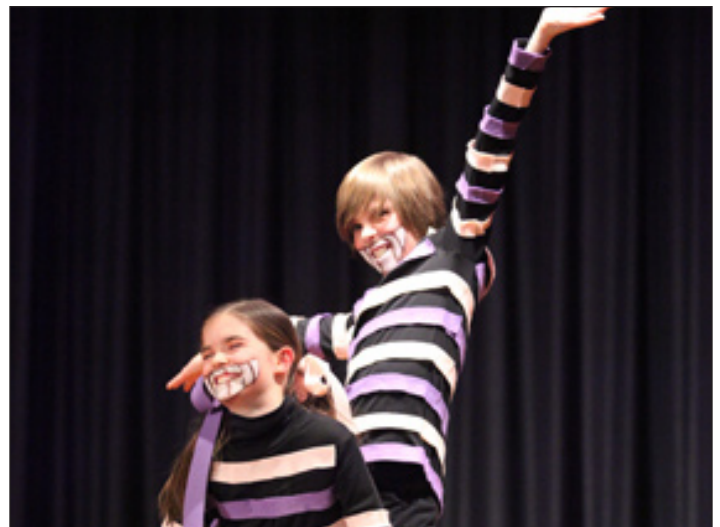
Classic characters came to life as the 5th graders at Eggert Elementary presented "Alice in Wonderland, Jr."