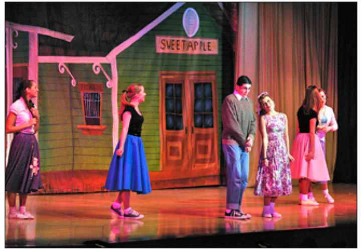
Pictured above are several members of the cast of Bye, Bye, Birdie , which was presented onstage at the High School in March. The cast consisted of 54 students, plus crew members and students in the pit orchestra.