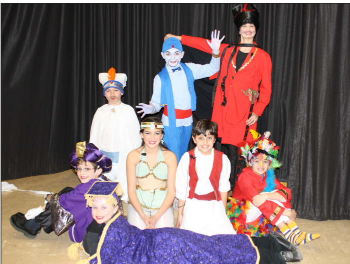
The leads from Ellicott Road Elementary School's presentation of "Aladdin Kids" pose backstage before their in-school performance.