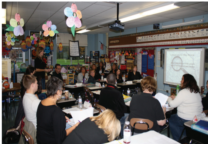
Orchard Park's 2nd grade teaches learning about Common Core Standards on Superintendent's Conference Day