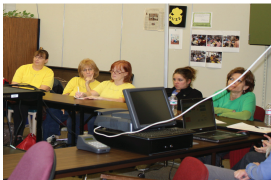
School lunch monitors being trained on Nutrikids prepayment system

With current national attention being focused on children's health and wellness issues, Orchard Park Central School District's Food Service Department is excited to provide parents a convenient, easy and secure online prepayment service to deposit money into your child's school meal account at any time. This service also provides parents the ability to view your child's account balance through a website called MyNutrikids.com . By having money in each child's account prior to entering the cafeteria, the lunch line becomes much more efficient.