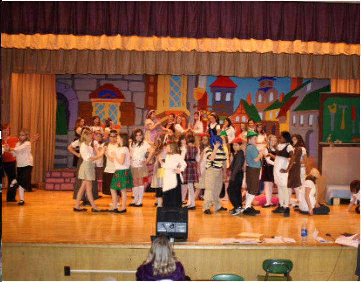
Pictured to the left Ellicott Elementary students in costume before their dress reheasal for their production of "The 100 Year Snooze"