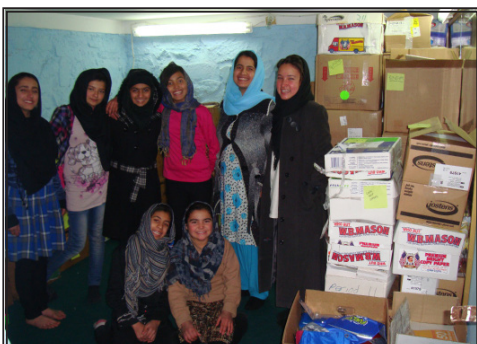
Students who attend SOLA have finally received the 2,560 lbs of supplies. They are pictured standing next to some of the boxes that arrived.

In years past, Educational Outreach has donated supplies to schools in Afghanistan. During the 2012-2013 school year the biggest shipment of supplies was planned. There were over 80 active volunteers and 20 schools within four districts that were involved in shipping the 2,560 lbs of school supplies. The supplies were sent to the School of Leadership Afghanistan also known as SOLA. The supplies were shipped by National Air Cargo for no charge during the summer of 2013. After many delays because of things like administrative clearances, they have finally arrived at the School of Leadership Afghanistan.