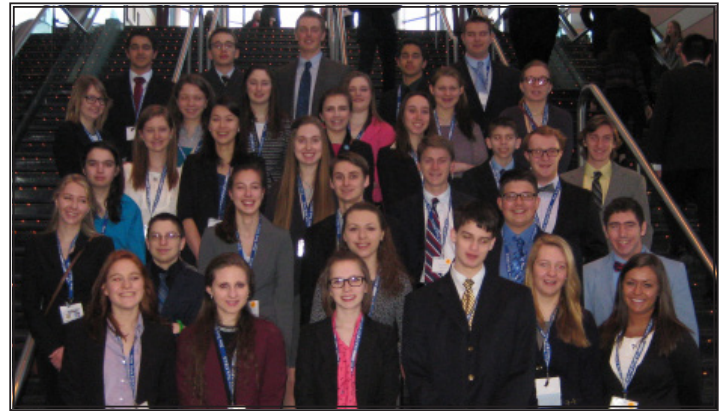
Thirty-four students from OPHS DECA attended the New York DECA State Career Conference in Rochester from March 5-7. They competed in various business-related contests, including marketing, finance and human resources. Six of these outstanding students qualified to represent Orchard Park DECA at the National Competition in Atlanta, Georgia this May.