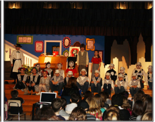
Pictured above are fifth graders at Eggert Elementary performing 101 Dalmations Kids . Eggert Elementary makes sure that all of the fifth grade students have participated in the play in order to make sure all students have an opportunity to see how they feel about the performing arts.