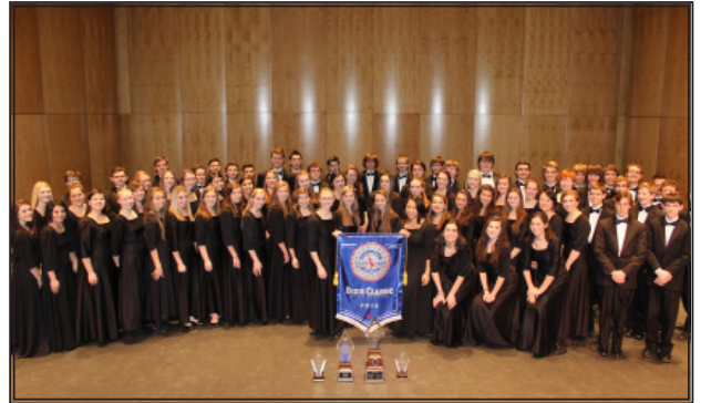
Pictured above are students from both the High School Wind Ensemble and the Symphonic Band who traveled to Chicago to participate in the Dixie Classic Music Festival.

members visited the Navy Pier before attending a concert by the world famous Chicago Symphony Orchestra in the legendary Symphony Hall. The students attended a pre-concert talk that previewed the evening's performance. As a special treat, the composer of one