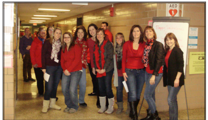
Each February, Windom staff walks around the building before the students begin to arrive in honor of Healthy Heart Month. Pictured are some of the Windom staff members during their annual walk.