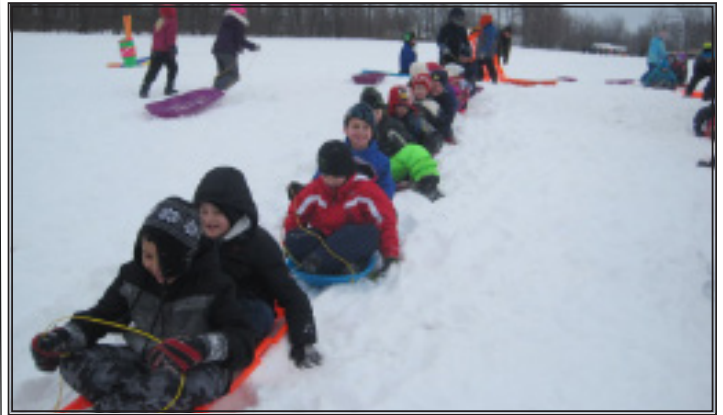
Third grade students at Windom Elementary celebrated the Olympics. They created flags from around the world and paraded throughout the school with them and then held some outdoor olympic activities including a sledding race, luge pull and a winter toss. Pictured above is the sledding race.