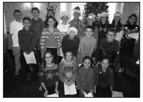
Ellicott Student Council members visited Orchard Heights to sing Carols on Tuesday, December 8<sup>th</sup>. The Student Council members are pictured above.