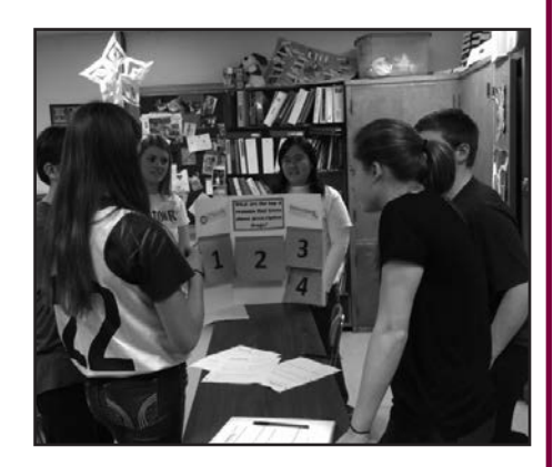
8th grade students move to different stations set up by D'Youville College students to learn about the issues associated with Prescription Drug use.

This is just one way that we can continue to work together to help keep our kids knowledgeable and safe!