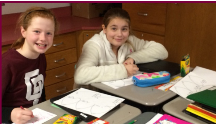
Fifth graders at Eggert Elementary are pictured above creating Valentine's for area veterans. Six classes at Eggert and Student Council students participated in the Valentine's for Veterans program.