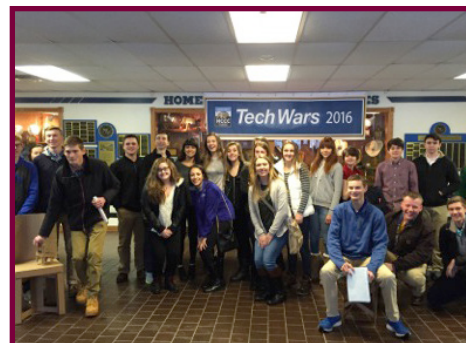
Orchard Park High School STEM students pose for a picture at the 20 th NCCC Techwars.