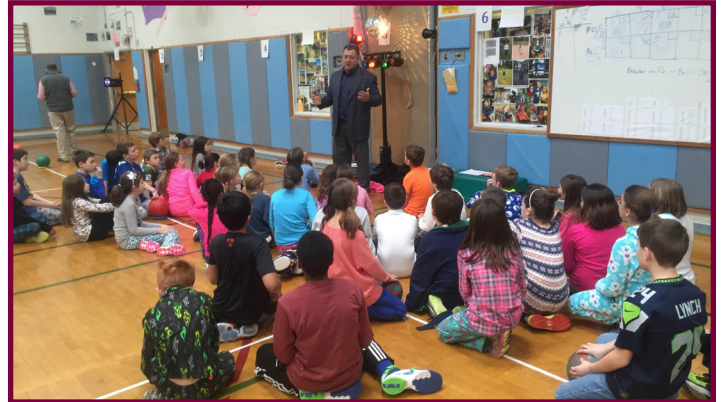
Senator Panepinto recognized 2 nd and 4 th graders at Eggert Elementary for their participation in the most recent Senate Artwork contest. Pictured above; Senator Panepinto speaks to Eggert students in the gymnasium.