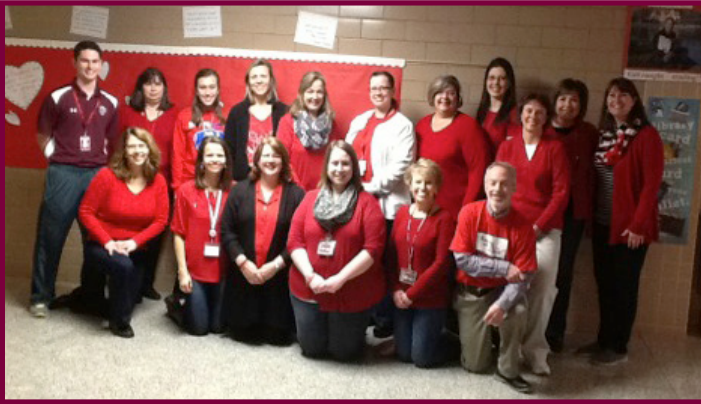
Windom Elementary teachers participated in National Wear Red Day® on February 5th by wearing red and doing laps around the building before students arrived to support the Go Red Campaign for Women.