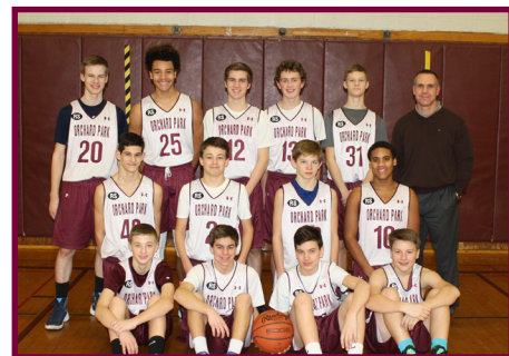
The modified basketball team takes a break from practice to pose for a picture.