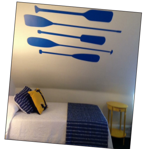
Different views of the Comforting Hugs for Hope Buffalo - Canalside room at the Ronald McDonald House.