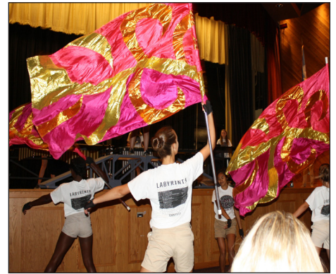
Teachers and staff members returned to school on August 31 st . After the annual Opening Day presentations the Quaker Marching Band surprised teachers and staff members with a performance in the High School Auditorium. The Colorguard is showcased in the picture above performing right in front of the stage.