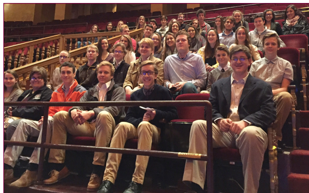
Orchard Park High School students take their seats at Shea's to watch the 43 North Pitch session.

On October 27, students from the Principles of Marketing, Advertising & Public Relations, and Business Law classes at Orchard Park High School attended the 43 North Final Pitch Session at Shea's Performing Arts Center. During this session, the 10 finalists (as determined by a panel of judges the previous day) pitched their businesses to a group of venture capitalists and entrepreneurs in a "Shark Tank"-like setting. Of the companies pitching, two will not receive a prize, five will win $500,000 prizes and three will move on to compete for the $1 million prize. For more information on 43 North and all they're doing to promote business and entrepreneurship in Buffalo, including donating the funds necessary for the bus for these OPHS students to attend this event, visit their website at www.43north.org .