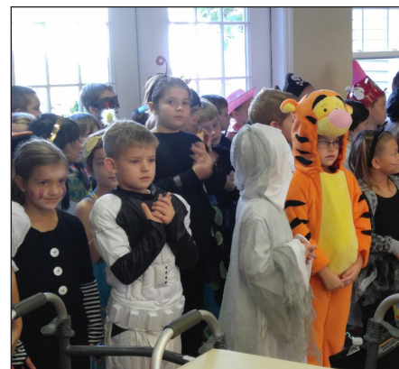
Ellicott first graders took a field trip to three local nursing care/assisted living facilities: Peregrine's Landing, Orchard Heights, and Fox Run on Halloween. They paraded in their costumes and sang Halloween songs to the residents. It was a great way to bring Halloween happiness to all of the residents.