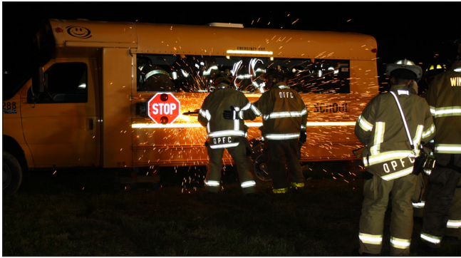
Members of the Orchard Park Fire Department are pictured above drilling open the school bus to demonstrate how they would remove potential victims after an accident.

The Fire Department started the drill doing an auto extrication drill on a