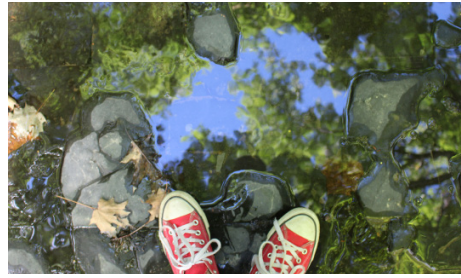
Orchard Park High School