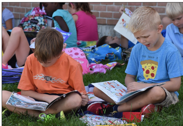
Students at Windom Elementary are pictured above reading during the Reading Invasion that took place at the beginning of the school year.

Windom Elementary had a successful Reading Invasion at the beginning of the School Year. The entire school "invaded" the back field for 30 minutes. Students brought books and a towel or blanket to lay on. Teachers brought lawn chairs and their own reading materials too. Kindergarten teachers brought