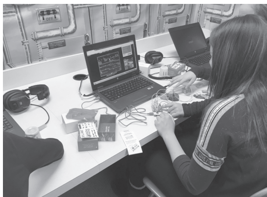
A Middle School student is pictured using the Makey Makeys to change the inputs on her Chromebook, allowing her to use playdough to play a simple keyboard, or run through a game.