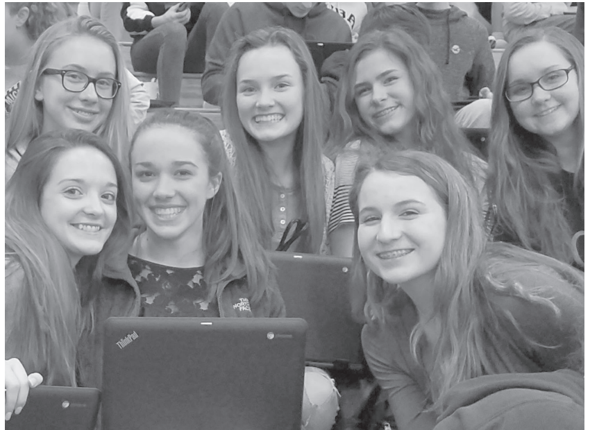
The high school students are all smiles after successfully receiving and logging in to their Chromebooks.

Prior to the distribution of the Chromebooks faculty and staff participated in professional development focusing on Google Apps For Education. This professional development helped to give our teachers the opportunity to learn how best to incorporate the