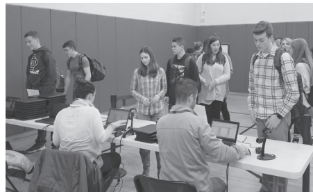
Students lined up by grade level to receive their Chromebooks purchased through the Smart Schools Bond Act.

With Chromebooks now in the hands of students in grades 5-12 the Orchard Park Central School District as a whole is looking forward to really integrating the technology into the classrooms to provide new and exciting learning opportunities for Orchard Park students.