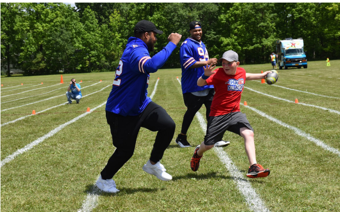
The Buffalo Bills came to Windom Elementary's 5 th grade field day. This was possible because students at Windom Elementary participated in the Play60 program and with the help of physical education teacher, Mrs. Lewandowski, logged their exercise. Windom had one of the highest participation levels from all the schools that were involved!