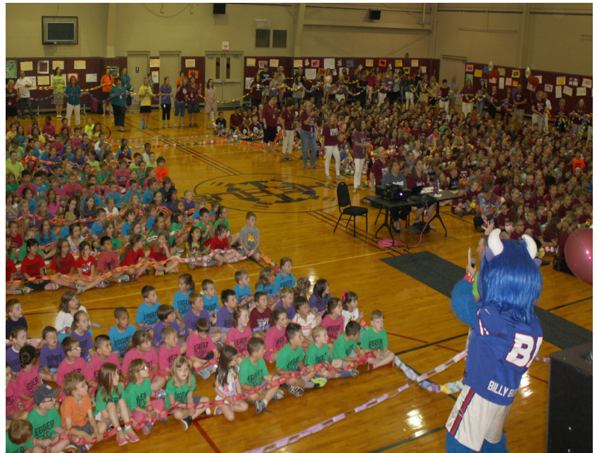
Eggert and South Davis students and staff are pictured at the Wesleyan Church of Hamburg's HUB. Everyone held the chain representing over 10,000 acts of kindness while singing Bruno Mars "Count on Me".

Because of the exciting accomplishments of Eggert and South Davis Elementary, the Rachel's Challenge organization decided