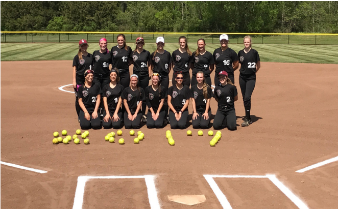
The 2017 girls Varsity Softball team is pictured before their first game on the new Varsity Softball Diamond.