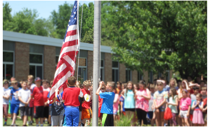
Ellicott fifth grade students raise the flag at the beginning of Ellicott's Flag Day Assembly.