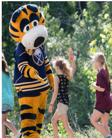
The Sabre Tooth is pictured hi-fiving South Davis Elementary students as they entered the HUB for the Rachel's Challenge Celebration on Monday June 12 th .

The Orchard Park Central School District was thrilled that Rachel's Challenge was able to come to Orchard Park to continue to spread the chain reaction of kindness.