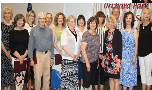
Pictured to the left are the 2017 retirees who were able to attend the ceremony on Tuesday, June 13 th . The retirees had over 539 years of experience within the Orchard Park Central School District.