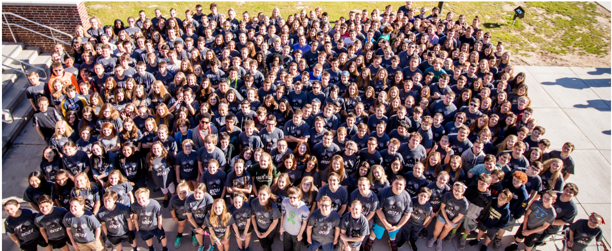
Eighth grade students posed for a picture outside of the Orchard Park Middle School on Friday June 2 nd during the 2 nd annual Eighth Grade Daybreak celebration.