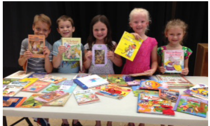
First graders at Ellicott Elementary are pictured picking out some summer reading material at Ellicott's 3 rd annual book swap.