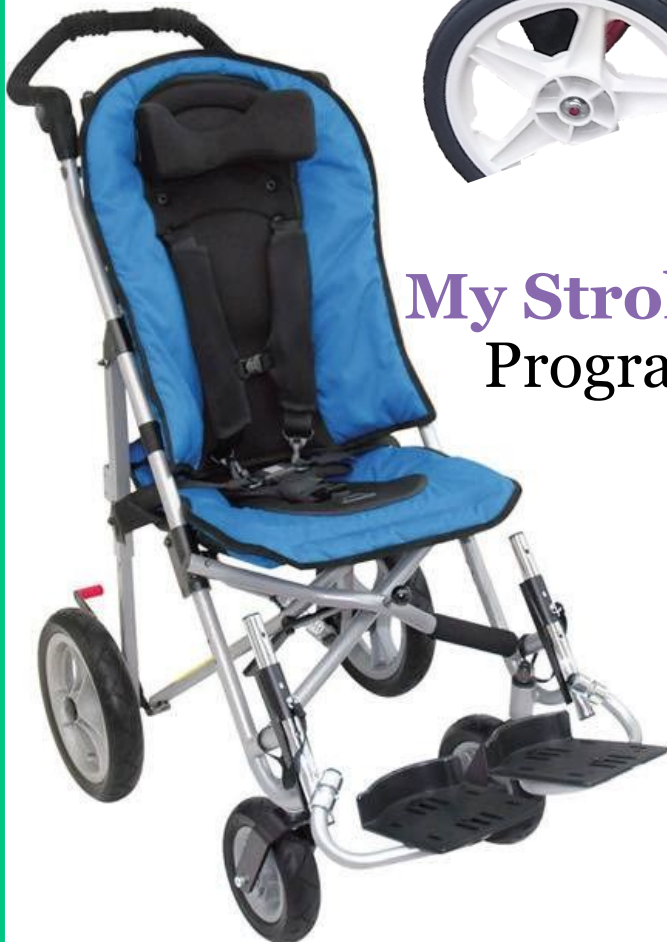
My Stroller® Program