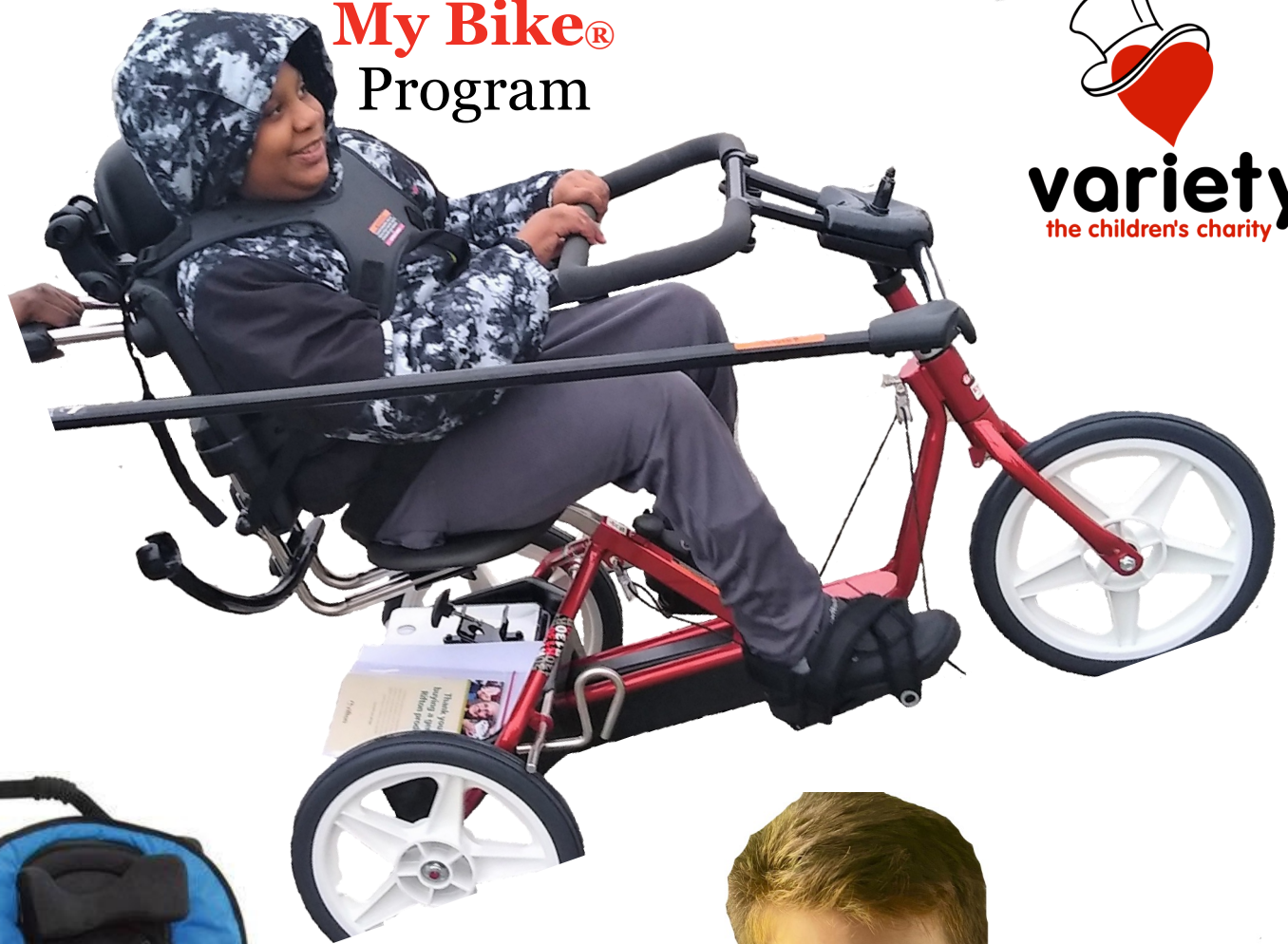
My Bike® Program