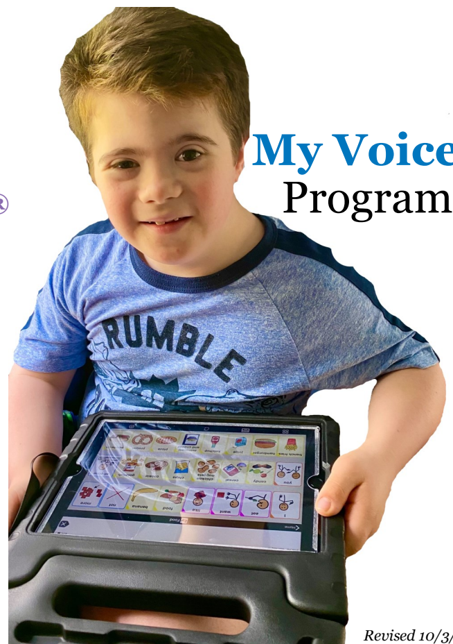
My Voice® Program