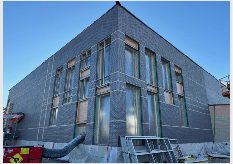
Above: a photo highlighting the finished brick at the northeast corner of the River Bluff addition as window frames are set in place

The foundation walls have been poured for the District Office elevator shaft. This milestone clears the way for the erection of the CMU elevator shaft to begin next week after backfilling the area. Meanwhile, Findorff masons have begun laying brick on the east elevation of the building, where the old Armory building was demolished.