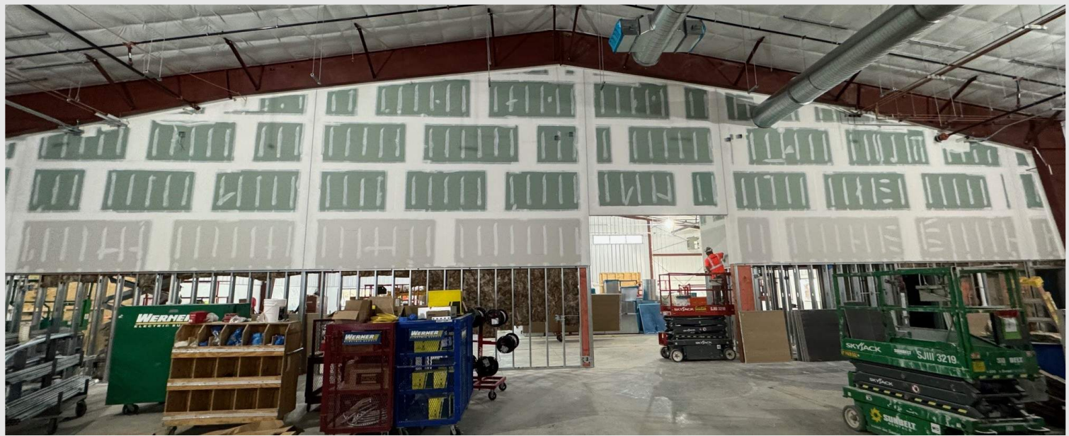
Below: a view of the progress in the Maintenance Building shop/garage space as drywall tape & finish is underway