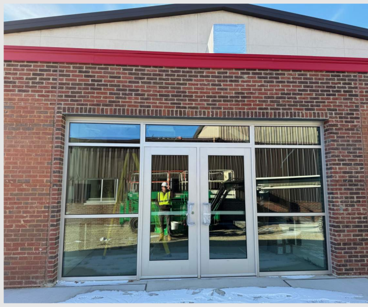
Top Left: a photo of the newly installed storefront at the east entrance to the Yahara Gym