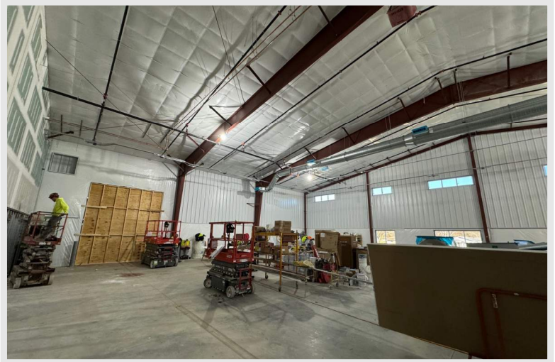
Above: a photo of the progress at the Maintenance Building as the interior metal liner panels are installed in the shop space

At the Yahara Gym, the aluminum storefront at the east entrance has been successfully installed, and the roof patching is complete, making the building weather-tight. Interior finish renovations will now commence.