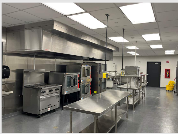
Bottom Left: a photo of the Kitchen as final cleaning prepares the space for turnover