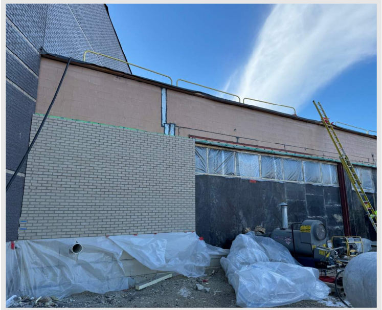
Top Right: a photo of the light brick installation progress near the main entrance to the River Bluff addition