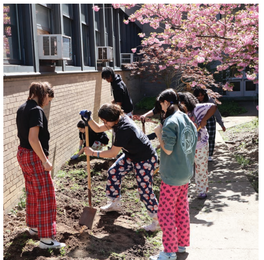
Campus Ministry volunteers leveled dirt and removed weeds in the St. Ann's Courtyard during Spirit Week.