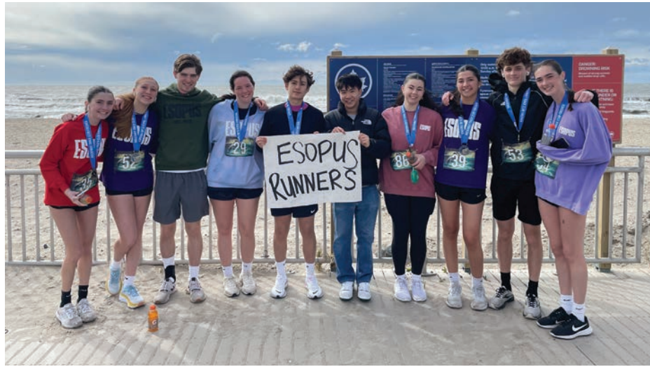
Molloy Students supported this year's Esopus Runners Fundraiser.