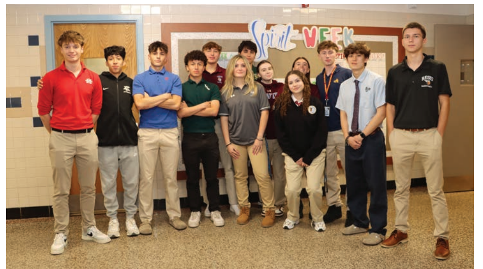
Stanners dressed like students from other schools on Anything Goes Day.

These ideas seem to be what the general opinion on