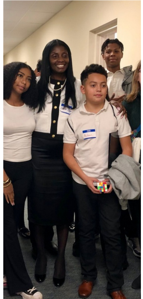
Nassau County Jack & Jill of America Inc. Event