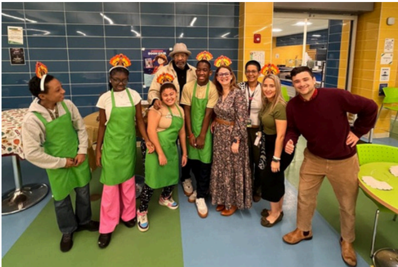
WMS STRIVE Friendgiving