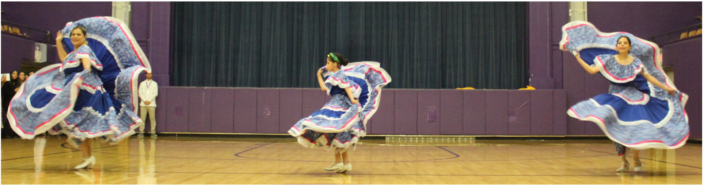
Traditional "baile folklórico," performed by students and family.