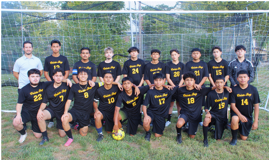
Boys Soccer 2024