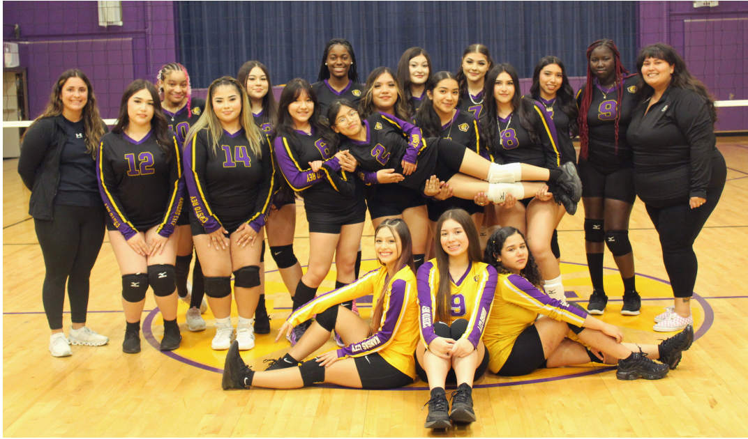
Girls Volleyball 2024

Fall Sports, Soccer and Volleyball, finished their season! This fall our sports had some successes, some losses, but most importantly, had fun and learned important character traits through sports.