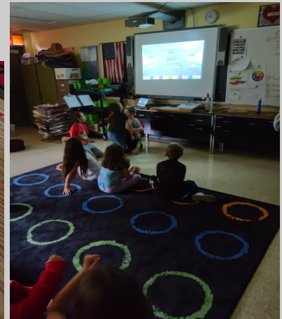
Line racers during Music class.