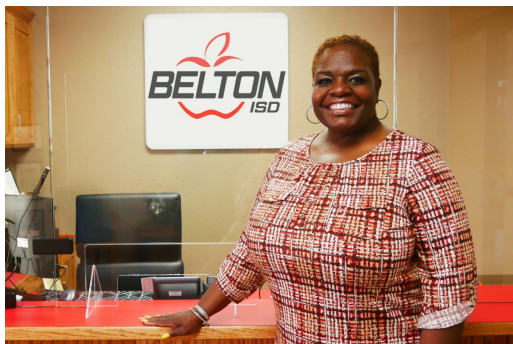
New District Receptionist Welcomes Visitors to Belton ISD Administration Building

12 Belton ISD Students Earn All-State Honors