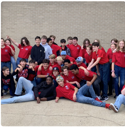
Belton Middle School Band