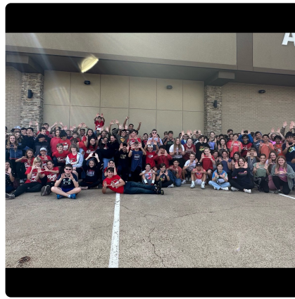
Lake Belton Middle School Band