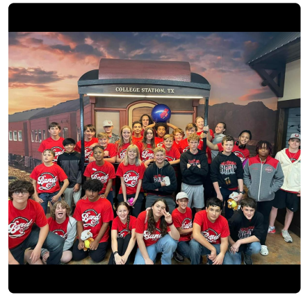
North Belton Middle School Band