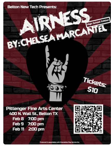
New Tech Theater