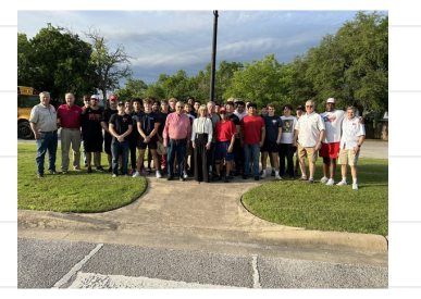
Seniors at the Flagpole