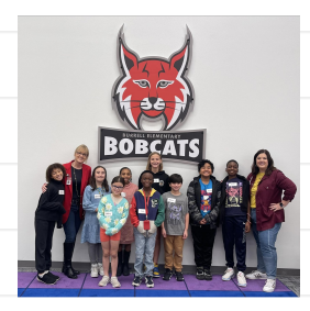
James L. Burrell Elementary Campus Visit