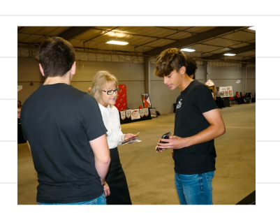
State of the District