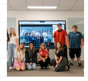
Superintendent's Student Advisory Council