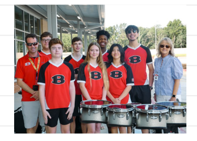
Hubbard Brand Tour Incoming Student with the M100 Drumline