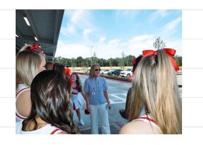
Hubbard Brand Incoming Student Tour