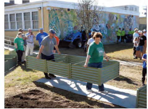
Southern Delaware School of the Arts began building its new garden on November 8 with the help of numerous volunteers.

The following week, students at Georgetown Elementary School harvested fresh vegetables from their HFHK garden. Staff and community volunteers built the garden this summer and a dedicated team of staff and students worked throughout the fall to prepare and plant it.