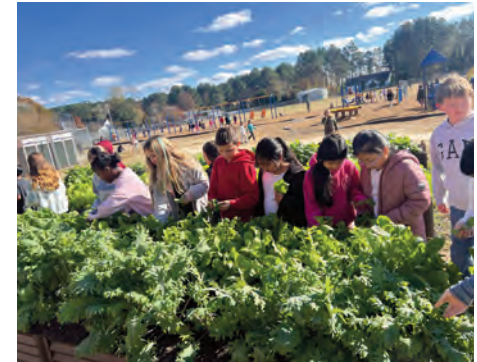
In November, students at Georgetown Elementary School began harvesting fresh vegetables from their new school garden, which was constructed last summer.