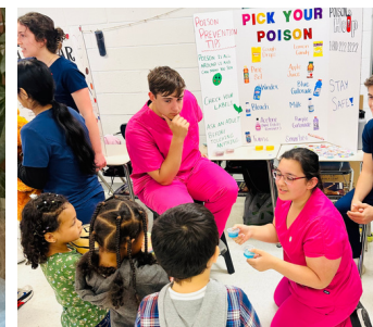
Students working with local elementary schools for the Teddy Bear Clinic.