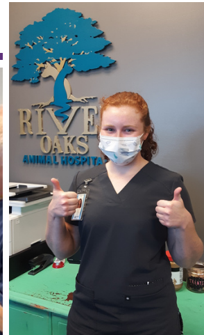
As seniors, students participate in internships.