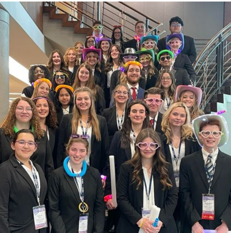
Pre-Med students are able to be a member of HOSA, and compete in the state leadership competition in Charleston.