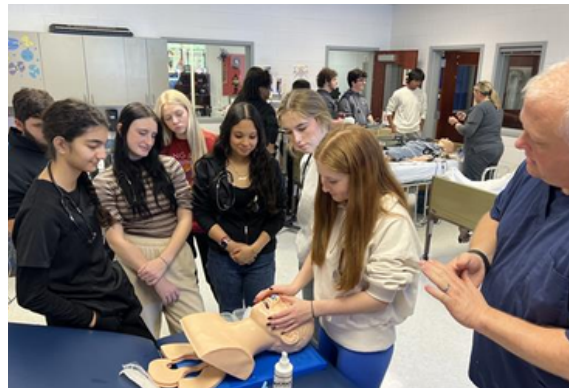
Students learn and practice CPR skills on state-of-the-art equipment.