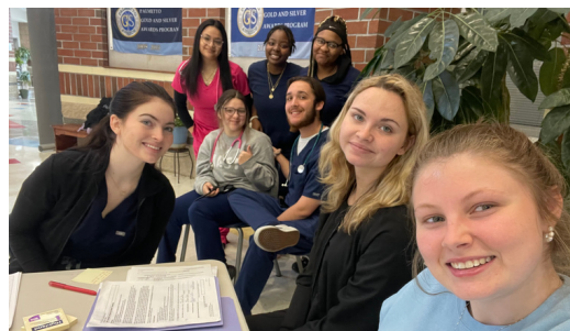
In the fall and spring, students help run the Red Cross Blood Drive.