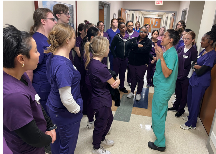
Pre-Med students get hands-on learning experiences with local medical facilities.

In Pre-Medicine, students are introduced to the exciting and greatly diverse career choices offered in the medical field. These potential areas include health and medical, surgical, veterinary, dental, psychological, therapeutic, and alternative treatments. As students grow into young professionals in the early stages of the program, they begin internships at local facilities such as hospitals, medical offices, and fire & rescue units. These internships help students to determine the areas of health and medicine that are best suited for them and the career paths they may take. Pre-medicine is both a challenging and highly satisfying course of study that helps students develop a passion and respect for the medical profession.