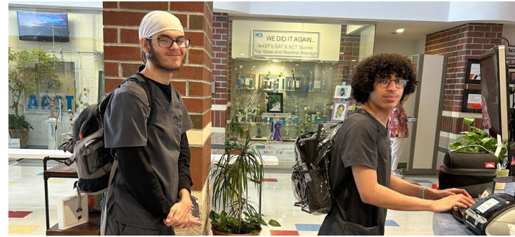
Through their internships, pre-medicine students gain exposure to a wide range of medical specialties, witnessing diverse healthcare procedures and treatments. As pre-medicine students returned this week from their internships at local medical facilities, they bring back a unique blend of theoretical knowledge, practical skills, and a heightened sense of purpose.