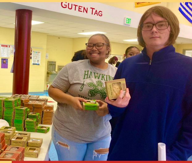
Thursday was March 14th, which we celebrate as Pi Day! Students were able to enjoy some pie to recognize Pi Day, 3.14.