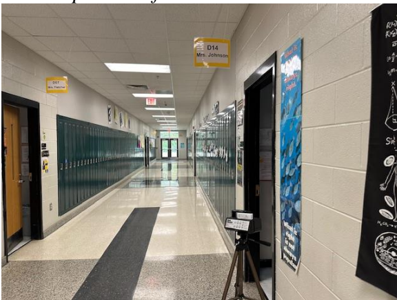
Air Sample outside Hallway