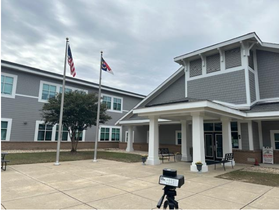
Outdoor Air Sample

This inspection was limited to the collection of non-viable spore trap air samples, particle counts, CO and CO 2 measurements that were collected from locations selected at random throughout the building. Descriptions in this report are based on looking at the structure from the front main entrance door. Moisture measurements and visual inspections were not conducted on this day.