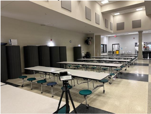
Air Sample in Cafeteria