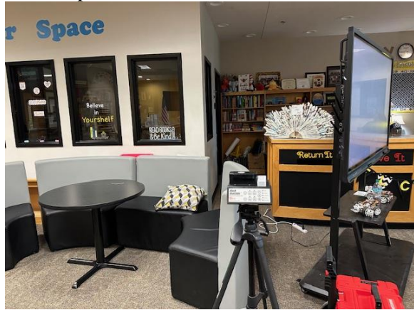
Air Sample in Media Center