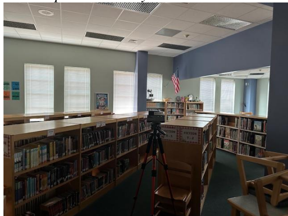
Air Sample in Media Center