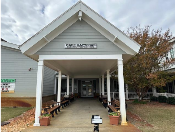
Outdoor Air Sample

This inspection was limited to non-viable spore trap air samples, particle counts, CO and CO 2 measurements that were collected from locations selected at random throughout the building. Descriptions in this report are based on looking at the structure from the street front. Moisture measurements and visual inspections were not conducted on this day.