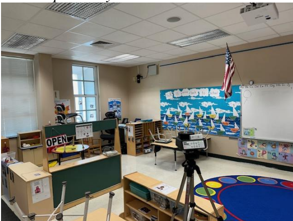
Air Sample in Classroom