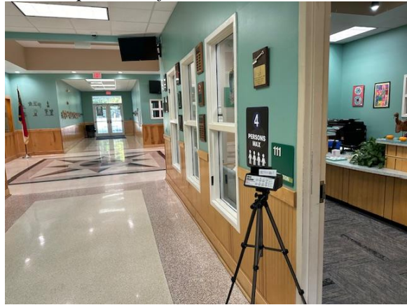
Air Sample in Hallway