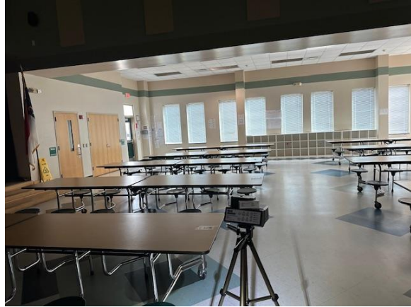
Air Sample in Cafeteria