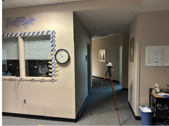
Air Sample in Office