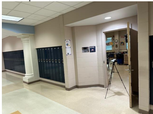
Air Sample in Hall