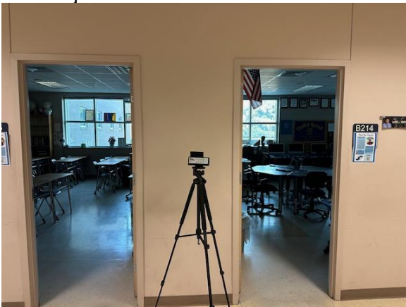
Air Sample in Hallway