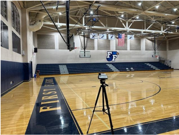
Air Sample in Gym