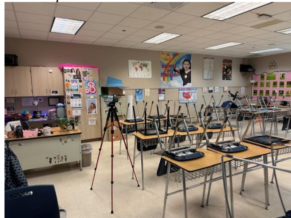
Air Sample in Classroom