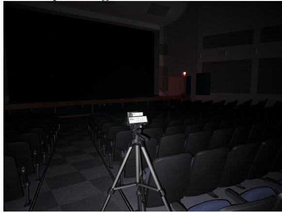
Air Sample in Auditorium