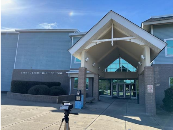
Outdoor Air Sample

This inspection was limited to non-viable spore trap air samples, particle counts, CO and CO 2 measurements that were collected from locations selected at random throughout the building. Descriptions in this report are based on looking at the structure from the main entrance door. Moisture measurements and visual inspections were not conducted on this day.