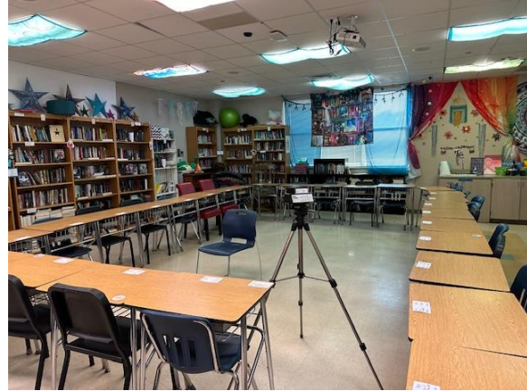
Air Sample in Classroom