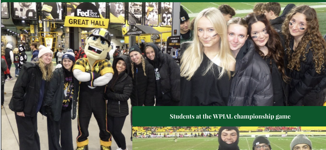
Students at the WPIAL championship game

The RAMPAGE is available online every Thursday under the high school Resources Tab. It is written by students, for students, and will make every attempt to report all school-related news. We welcome freelance submissions, suggestions, comments, and story ideas from students and staff. Since this is a student-publication, we realize we make mistakes: we encourage readers to report mistakes to the staff writers; you may win a prize if you locate any/all mistakes.