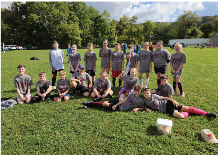
Fifth and sixth grade youth soccer team