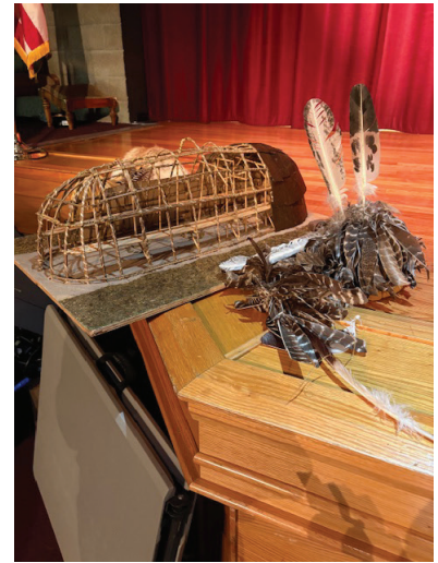
Fourth grade participates in a Native American presentation