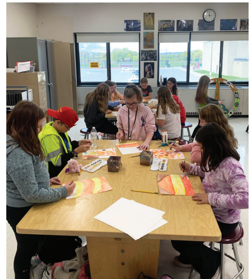
Elementary art club has had fun making yarn and felt owls and painting a fall sunset.