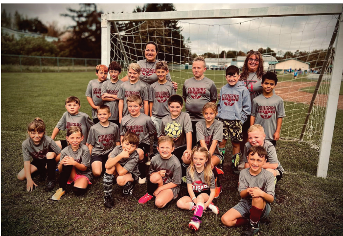
Third and fourth grade youth soccer team