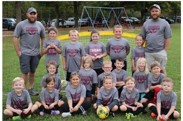
First and second grade youth soccer team