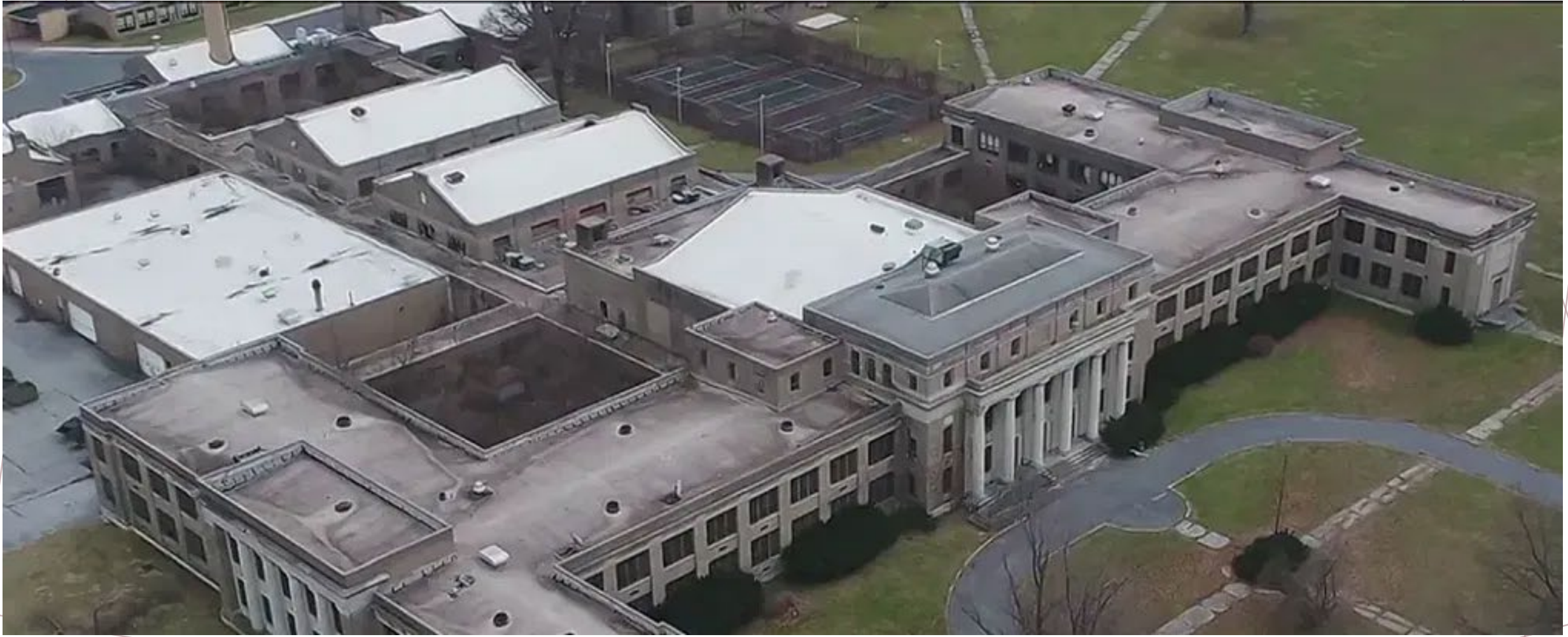
Skyview of the full building. Demolition of the back portion of the school but preserving the face of the building. It would keep its Historical Value.