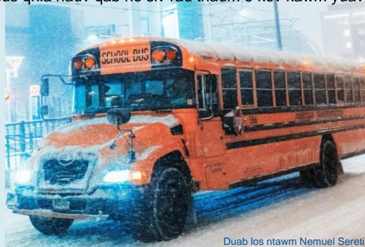
Duab los ntawm Nemuel Sereti