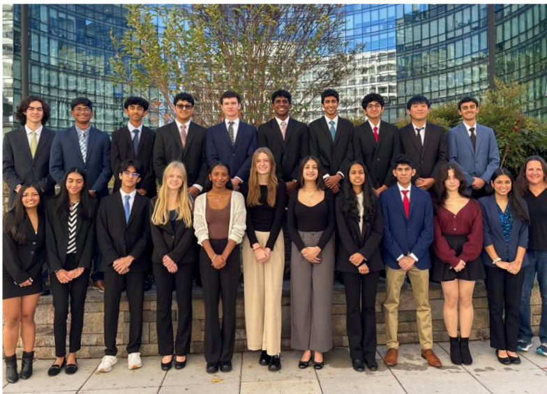
Model Congress students competed in Washington, DC