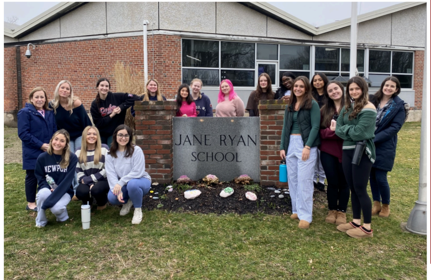
Students from the THS UConn Individual and Family Development Class visit Jane Ryan

For the past eight years, Jane Ryan School has offered an internship for THS juniors and seniors who are exploring teaching as an area of study in college. Spending time in the classrooms allows THS students to more deeply explore their planned career and obtain valuable experience. Jane Ryan students benefit from additional classroom support and modeling, and Jane Ryan teachers have a helping hand in the classroom! The program also hosted the THS UConn Individual and Family Development class for a half day visit.