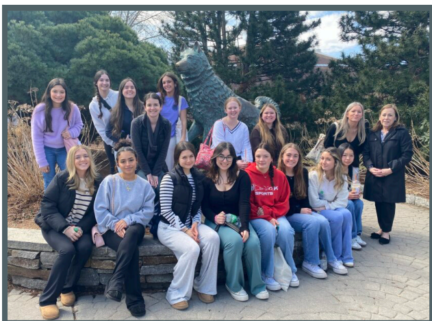
UConn Campus Visit: Child Development Labs

Students participated in field trips: Jane Ryan Elementary, UConn Storrs (Individual & Family Development Class), Park Avenue Medical Center, Culinary Institute of America, January Digital