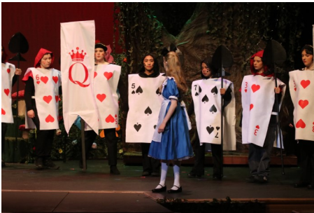
Students perform in the fall play.

Keep an eye out on the Grant YouTube channel for the recorded version of our production and head to the Grant Facebook page for more photos.