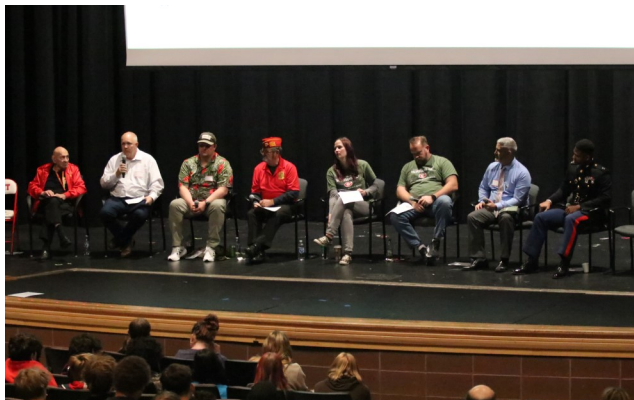
Veterans Day Panelists

These events highlighted the significance of honoring those who have served and provided our students with valuable opportunities to learn, give back, and connect with veterans in meaningful ways. On behalf of everyone at Grant, we thank all veterans for their service and sacrifices.