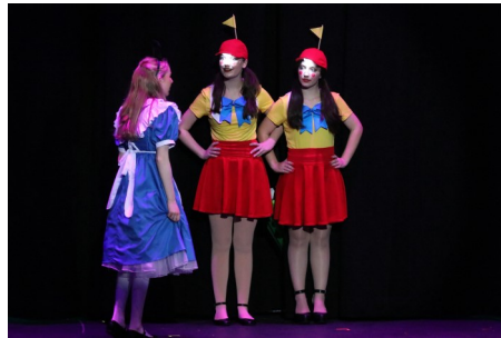
Students perform in the fall play.