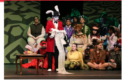
Students perform in the fall play.

This past weekend, the cast and crew of Alice in Wonderland dazzled audiences with three fantastical, wacky performances that brought the whimsical world of Wonderland to life! From Alice's curious journey down the rabbit hole to her triumphant rise as a queen, each scene was filled with colorful characters, clever dialogue, and stunning visuals. A huge congratulations to all our talented performing and tech Bulldogs for their incredible dedication, creativity, and teamwork that made this production unforgettable. Behind the scenes and onstage, you all worked together to create a magical experience that truly showcased the spirit of Wonderland. Bravo on a spectacular show!