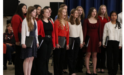
Chamber Singers perform at Leisure Village.

Our Chamber Singers performed for residents at Leisure Village during their Veterans Day celebration. Their heartfelt renditions of the national anthem, America the Beautiful, and God Bless America created a moving tribute to the veterans in attendance. The singers brought joy and reflection to the Fox Lake residents, emphasizing the profound connection between music and gratitude.