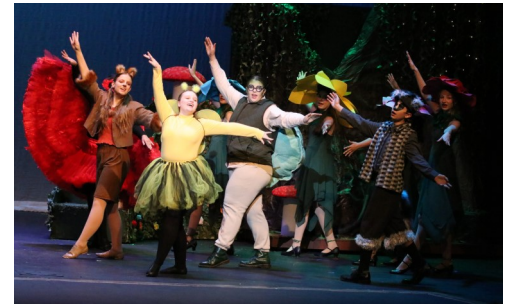
Students perform in the fall play.